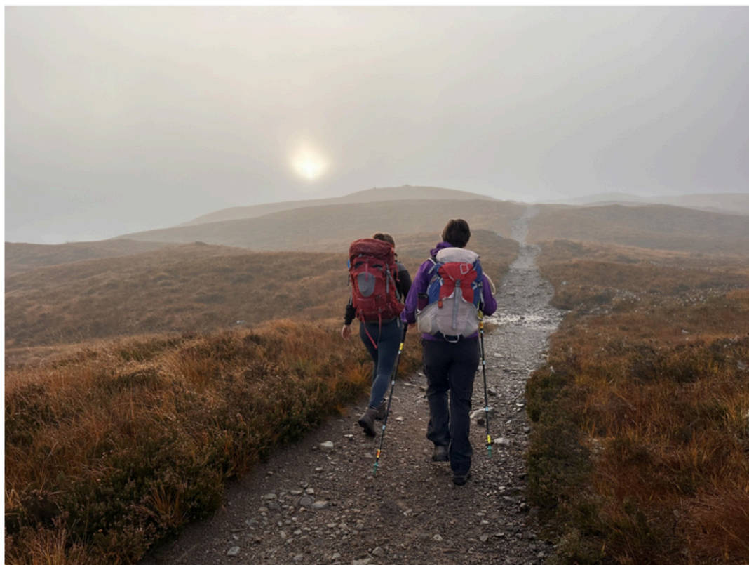
West Highland Way, Loch Lomond & Trossachs National Park

Scotland's designated long-distance routes have huge potential to benefit walkers, nature and local communities. But they need clearer support and funding. Ahead of the Scottish elections later this year, see what National Trails UK is calling for to protect and grow these iconic Scottish trails. Learn more