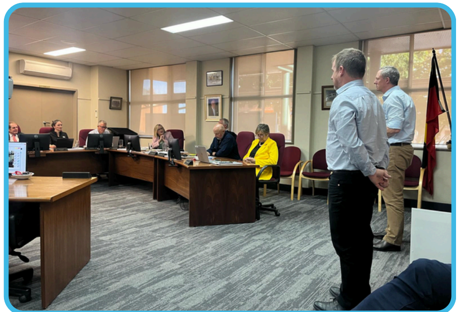
Oberon Shire Council meeting, 18 March 2025

A development application for three 160m wind monitoring masts was submitted to Oberon Shire Council in January 2025, with an outcome expected in April or May.