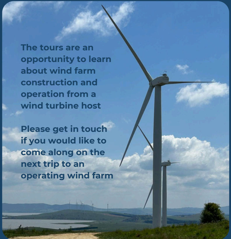
Capital Wind Farm tour during November 2025

Please get in touch if you would like to come along on the next trip to an operating wind farm