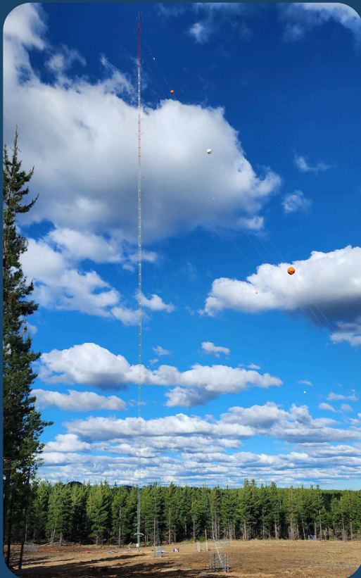
Installation of second 160m wind monitoring mast

The tours are an opportunity to learn about wind farm construction and operation from a wind turbine host