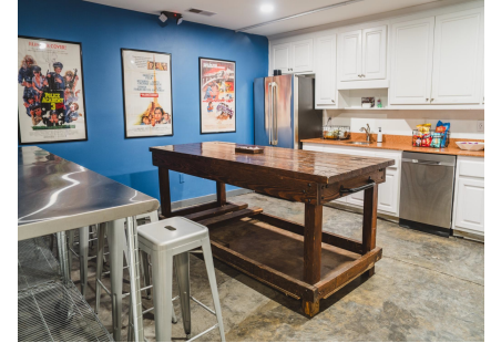
2nd Floor // Upstairs