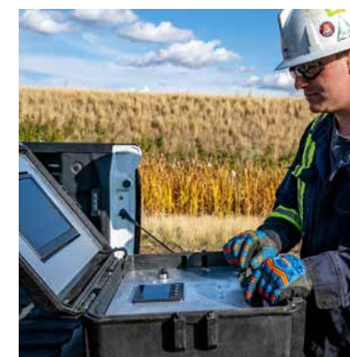
Automated cannon is controlled remotely from the ground

The result? Faster cleaning cycles, lower environmental impact, and tank cars returned to service quicker than with conventional tank car cleaning methods.