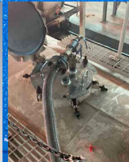
3D Rotary Orbital Sprayer – Fastened in the manway, the sprayer rotates a full 360 degrees and sprays down the tank car in 20 minutes