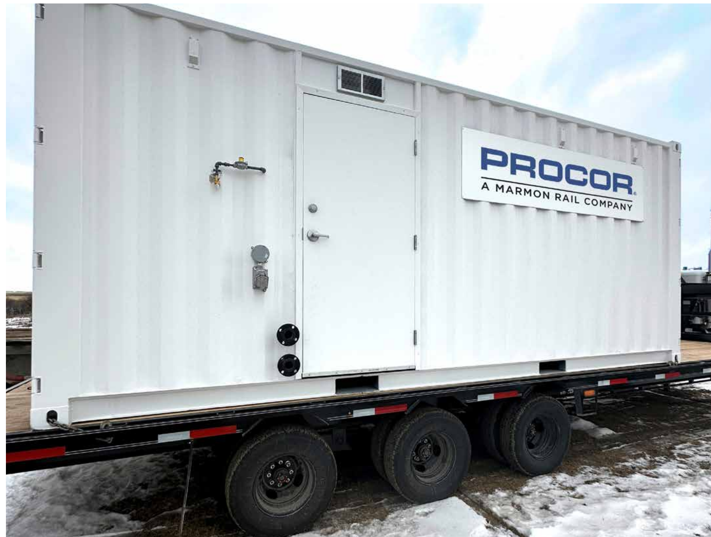
Insulated container houses the filtration unit