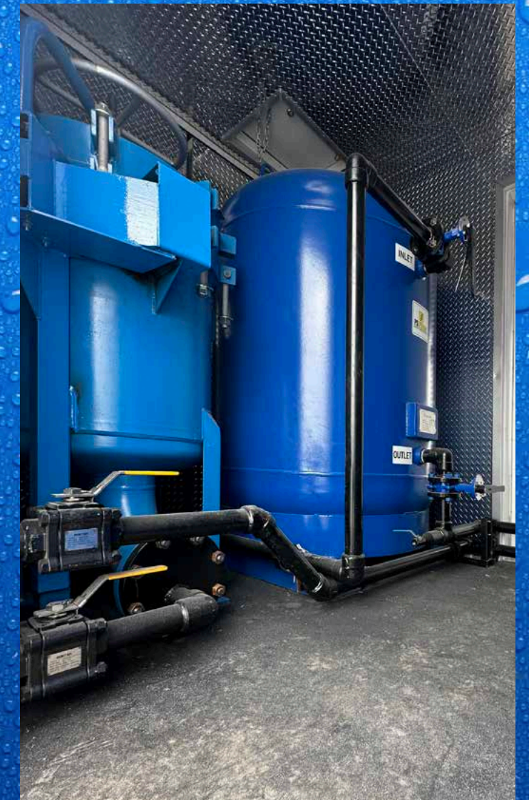
Three part water filtration system and holding tanks for tank car cleaning