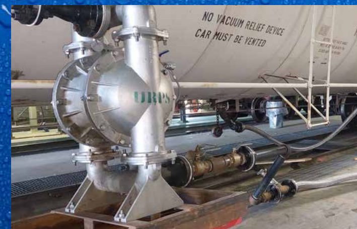
Pump to offload effluent for filtration process