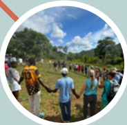
Bois de Lance

In November our team visited the village of Bois de Lance, dedicating the land for our newest Haitien Remote Clinic. In anticipation, its citizens had already brought piles of sand/stones to the site. They currently have no access to healthcare. Thanks to Grace Powell Church for fully funding this project!