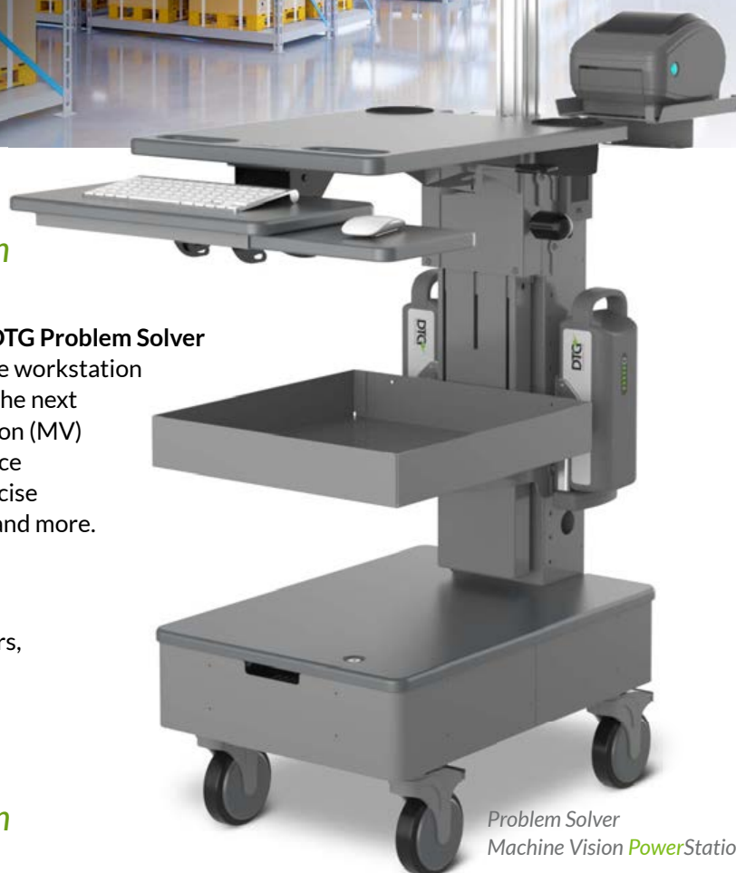
Problem Solver Machine Vision PowerStation