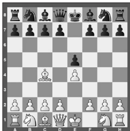
FIGURE 1-2: The Bishop's Opening.