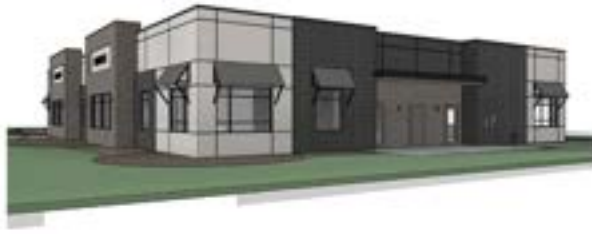
6 VIEW FROM SOUTHWEST SCALE: 1/8" = 1'-0"