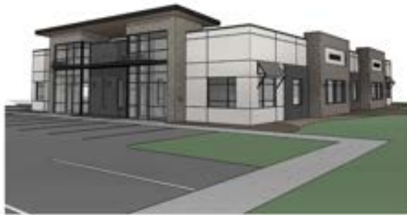
5 VIEW FROM NORTHWEST SCALE: 1/8" = 1'-0"