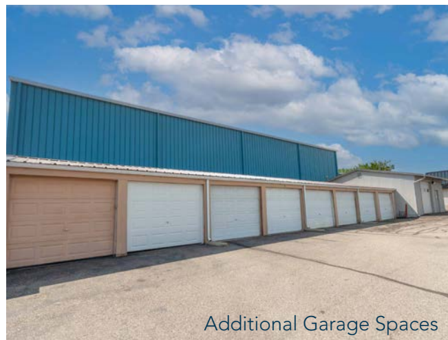
Additional Garage Spaces