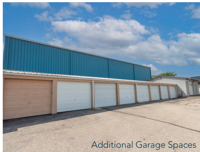
Additional Garage Spaces