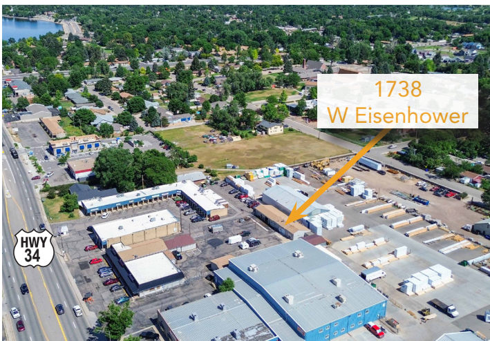
1738 W Eisenhower