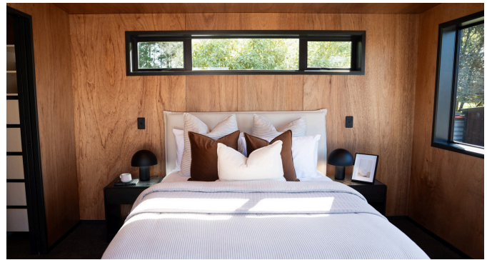
10x 4m One Bedroom $127,000 (GST Incl)