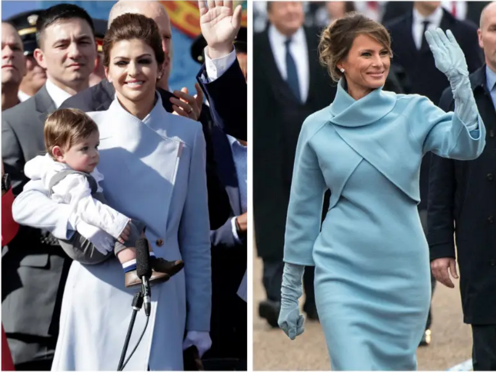
Left: Casey DeSantis at Ron DeSantis' first inauguration as Florida governor in 2019. Right: Melania Trump at Donald Trump's presidential inauguration in 2017.