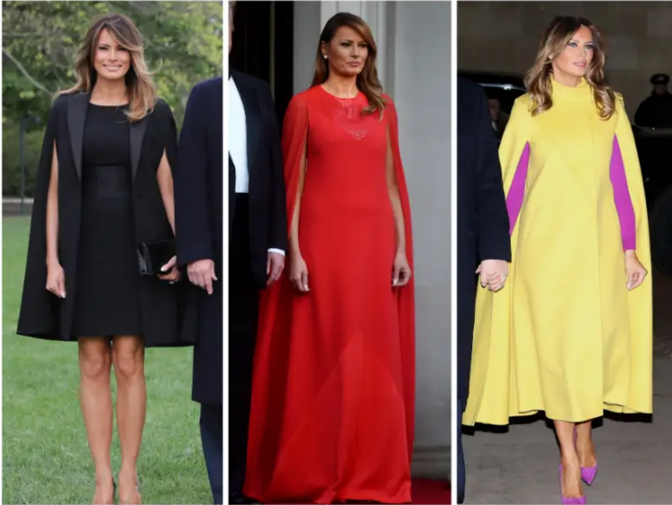
From left to right: Melania Trump in a Givenchy tuxedo cape dress at Mount Vernon in April 2018, attending a state dinner in a red Givenchy cape dress at Winfield House in June 2019, and wearing a Valentino yellow caped coat to meet with Prince Charles and Camilla in December 2019.