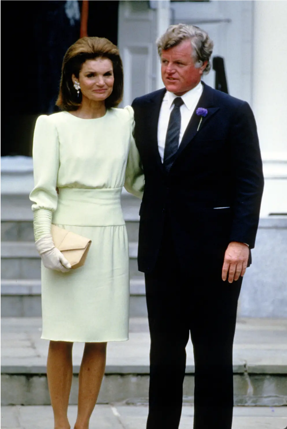
Jacqueline Kennedy Onassis and Ted Kennedy attend the wedding ceremony of Caroline Kennedy and Edwin Schlossberg in the Church of Our Lady of Victory on July 19, 1986, in Hyannis Port, Massachusetts.