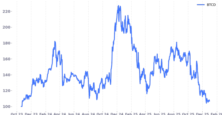
Absolute return (%) of FiCAS Dynamic Crypto ETP (net of fees).

Structural signals continue to build: Vanguard opening access to Bitcoin and Solana ETFs and the Chainlink ETF listing broaden the addressable base beyond L1s, but flows remain concentrated in the majors. Coinbase's push into prediction markets and tokenized equities, Interactive Brokers' stablecoin deposits, and conditional Banking charters for Circle and Ripple point to settlement rails being put in place. JPMorgan's tokenised money-market fund on Ethereum underscores that cash equivalents are moving on-chain; if scaled, this can deepen liquidity for collateral and funding markets. Against that backdrop, Digital Asset Treasuries' $2.6B of inflows complement December's $457M into U.S. spot Bitcoin ETFs, yet ongoing miner supply keeps the balance delicate, reinforcing the need for steadier breadth before any broader risk rotation.