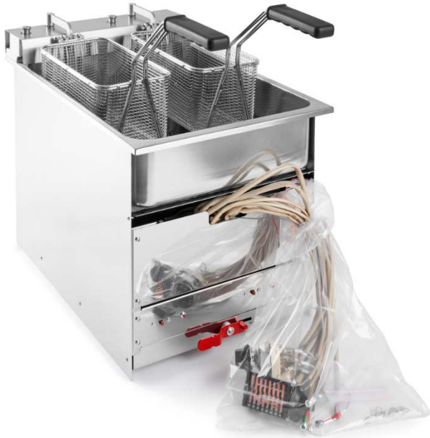
illustration picture EVO400-E