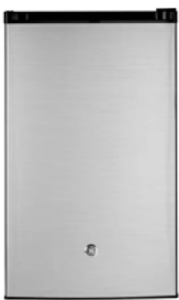
Compact Refrigerator 4.4 cu. ft. mini refrigerator with built-in freezer compartment