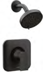
Multi Function Shower Head 1.75 GPM pressure balanced metal shower head