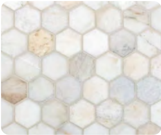
Marble kitchen backsplash Hexagon marble mosaic tile behind kitchen counter