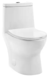
Toilet White ceramic dual-flush toilet with white seat