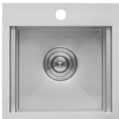
Kitchen Sink Stainless steel workstation sink with colander and cutting board cover