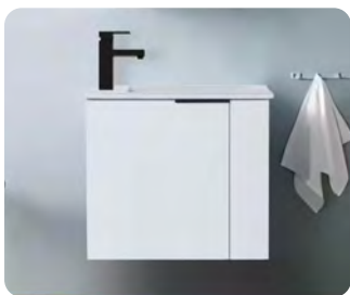
Wall Mount Vanity Modern white vanity with white ceramic top