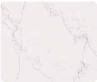
White Caesarstone Countertop Engineered quartz, offering durability and low-maintenance smooth surface