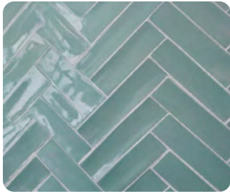
Shower Wall Tile Glossy ceramic tile in herringbone pattern