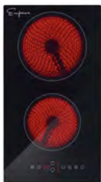
Electric Cooktop 240-Volt, 2 elements radiant electric cooktop with a 1,200-Watt melt element