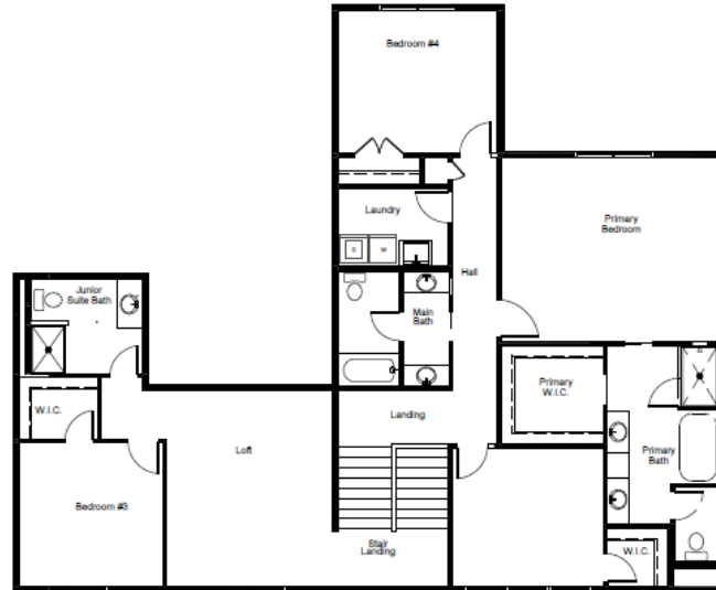
Second Floor Layout