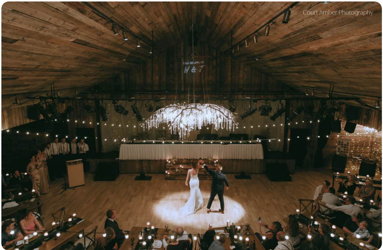
Court Amber Photography