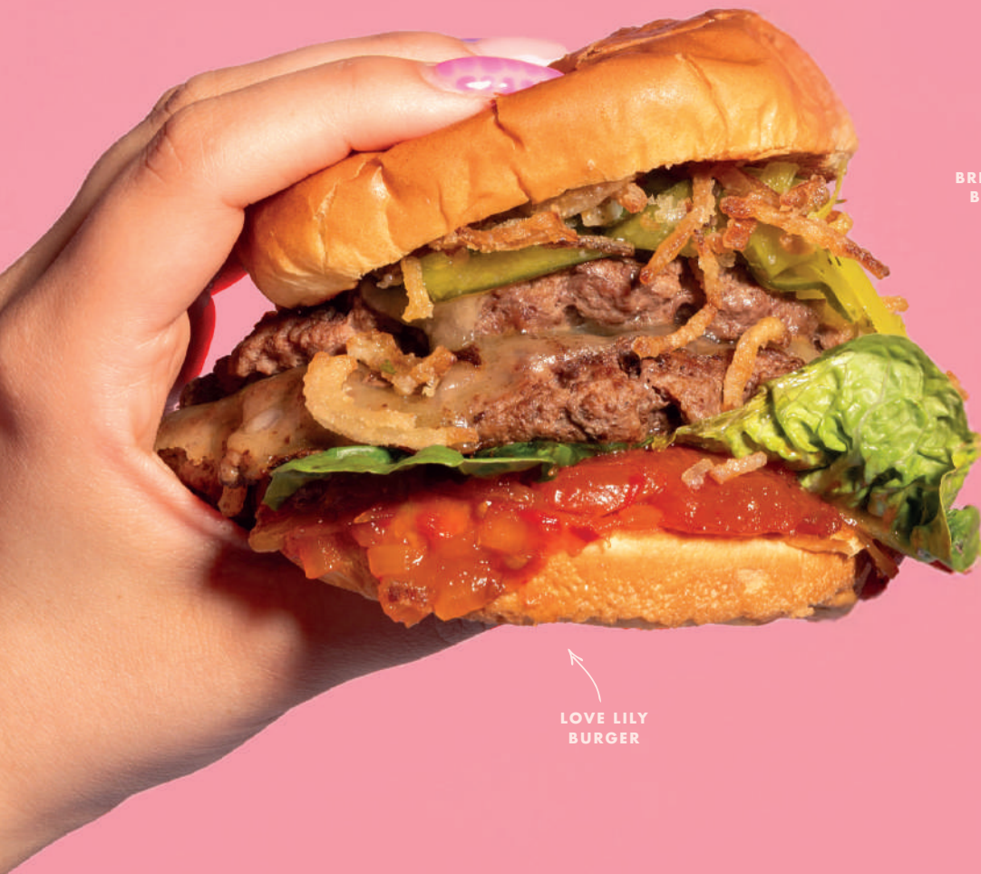
LOVE LILY BURGER

Double stacked sausage patties, melting Monterey Jack cheese, grilled smoked streaky bacon, homemade mini Love Lily potato rosti, free range fried egg and homemade chilli jam in a toasted brioche bun. Served with seasoned house potatoes and chipotle mayonnaise.