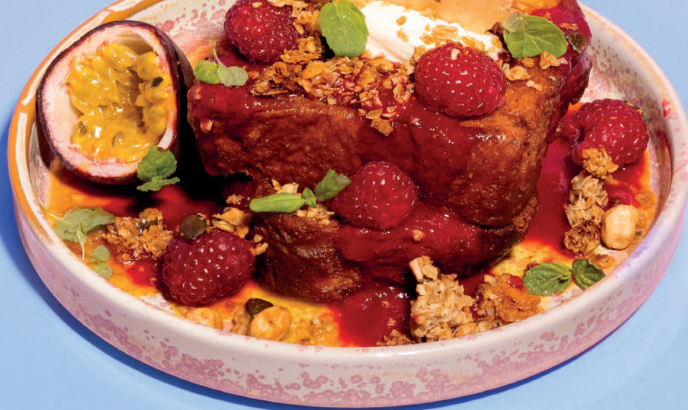
HONEY BUTTER FRENCH TOAST