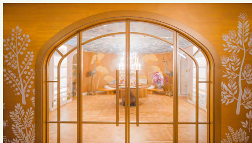
LALA Curio's flagship showroom entrance