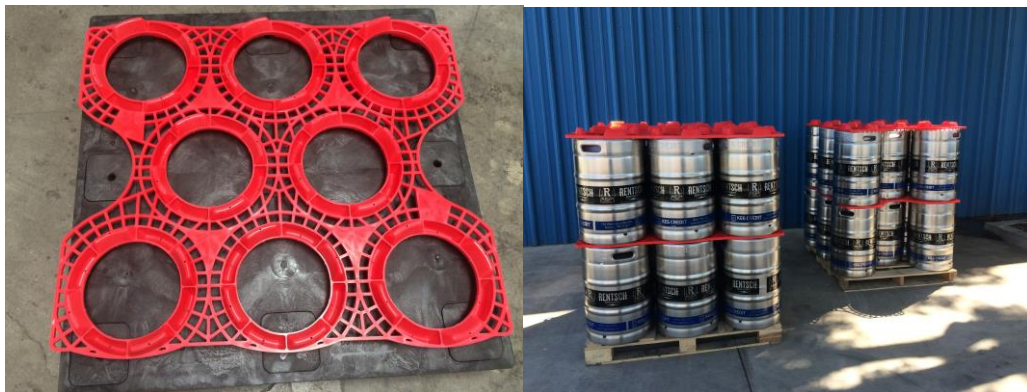
More containers in less space

Low cost transit packaging for exporting full beer containers and long-term empty keg storage