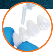
Veneer, Adhesive Bridge