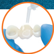
Crown & Bridge