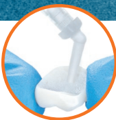
Post, Bonding for Build-up, Crown