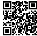
Video: Transfer from primary to backup power