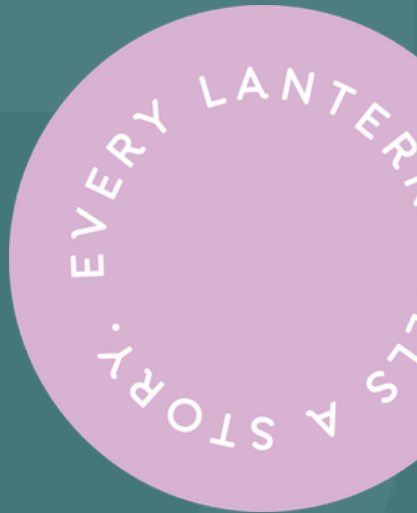
MACA DEL PILAR