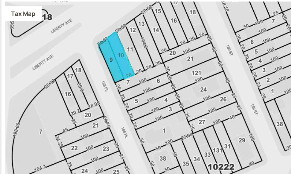
Zoning and Land Use Map (Zola)