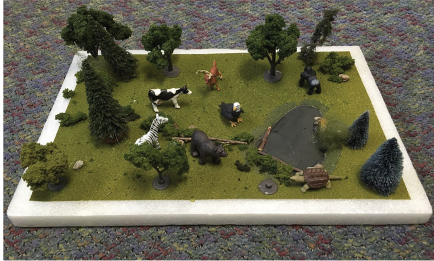
Figure 1. Diorama provided to parent-child dyads. Note, animals typical to the North American forest ecosystem (e.g., deer), as well as those that are exotic (e.g., zebra), were included for the original purpose of the study, but a distinction between these was not made for the current purpose.