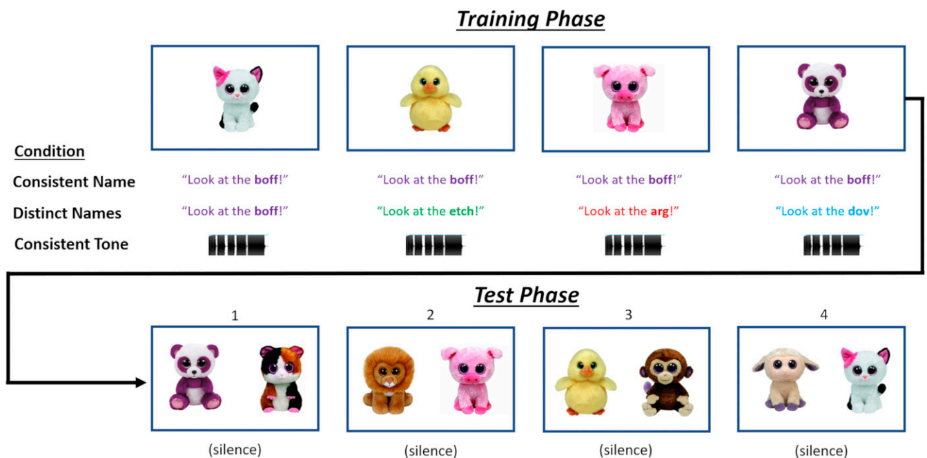
Fig. 1. During the Training Phase, all infants viewed four objects, presented one at a time in a random order. Objects were paired with either a Consistent Name, Distinct Names, or a Consistent Tone. In four silent Test Trials, all infants viewed each of the training objects paired with a new object from the same category. In the Test Phase, the training objects were presented in reverse order from the Training Phase.

To evaluate these predictions, we developed a stringent test of recognition memory (Fig. 1). In the Test Phase, we presented the training objects in reverse order. Thus, the final object presented during training (on Training Trial 4) appeared in the first test trial (Test Trial 1) and vice versa. If infants in the Consistent Name condition encoded the final training object primarily as a