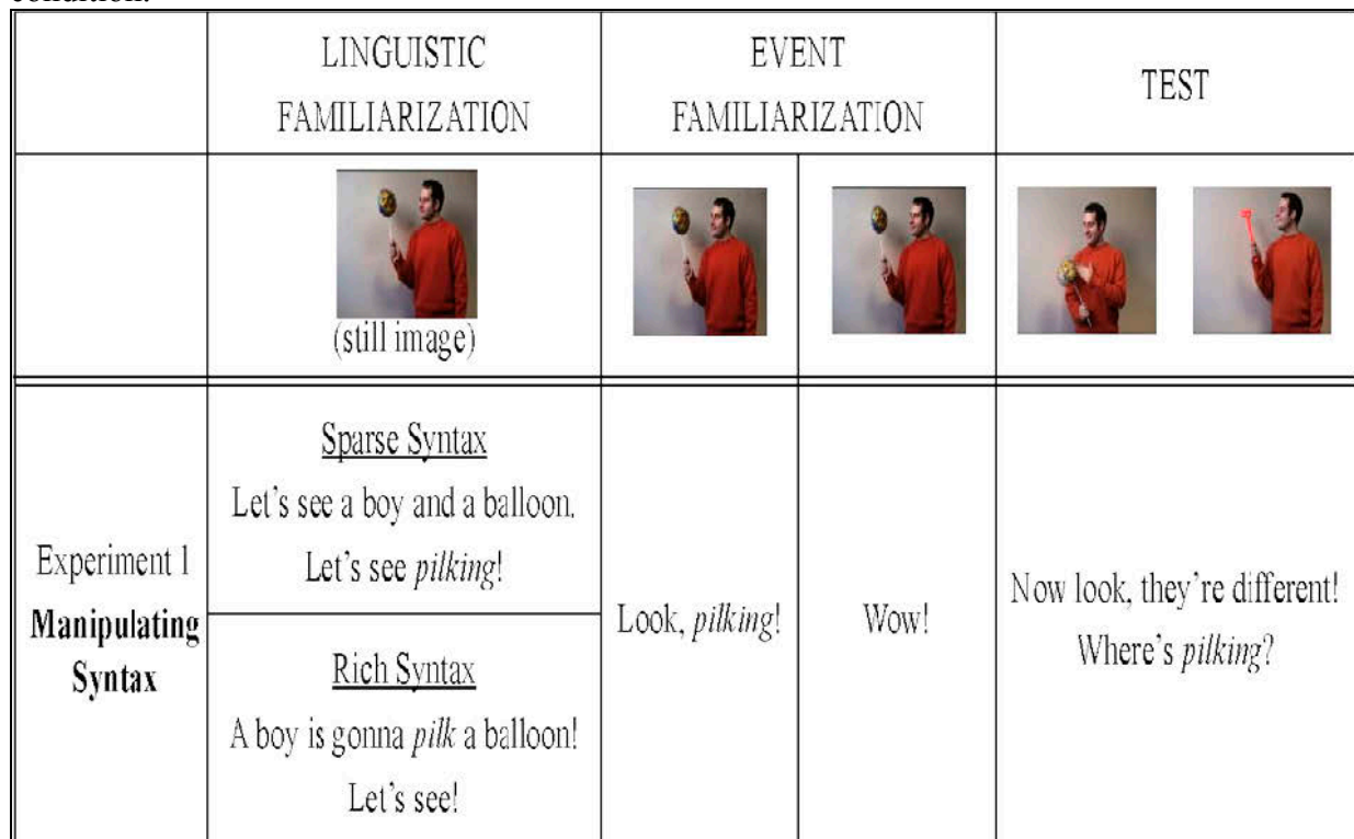
TABLE 1. Experiment 1. One representative trial (of six) in each condition.