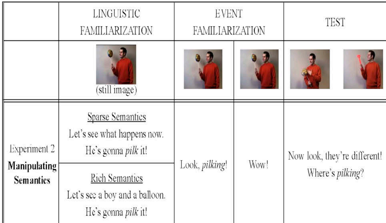
TABLE 3. Experiment 2. Representative trial in each condition.