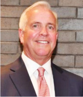
Mayor Terry D'Arcy