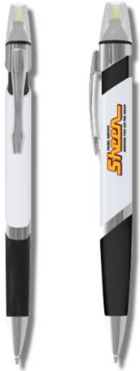
SHEEN HIGHLIGHTER & PEN