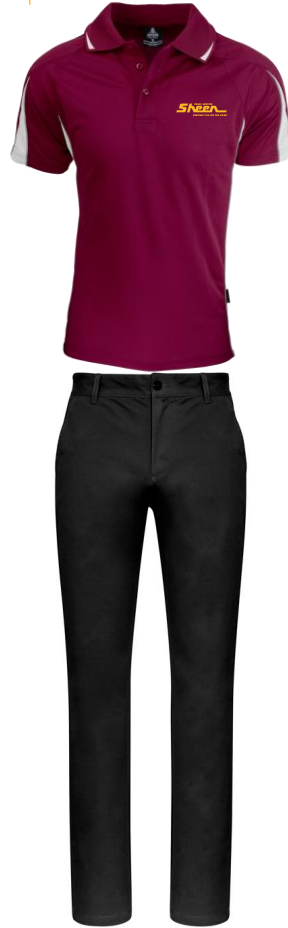
MEN'S EUREKA POLO