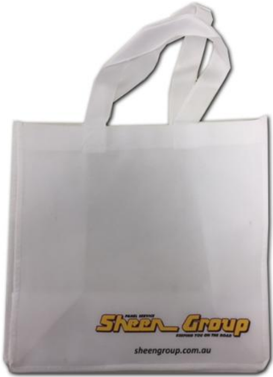
SHEEN TOTE BAG