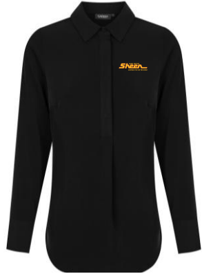
QUINN L/S SHIRT

All footwear MUST to be black and professional.