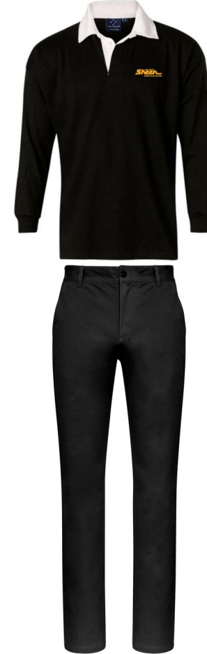
MEN'S LONG SLEEVE RUGBY TOP