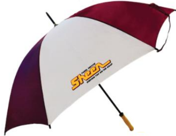
SHEEN SPORTS UMBRELLA