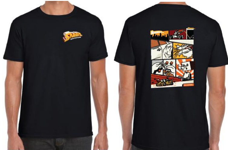
2026 COMIC TEE