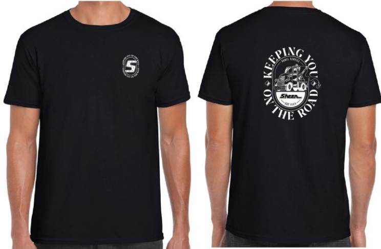
2025 RETRO TEE