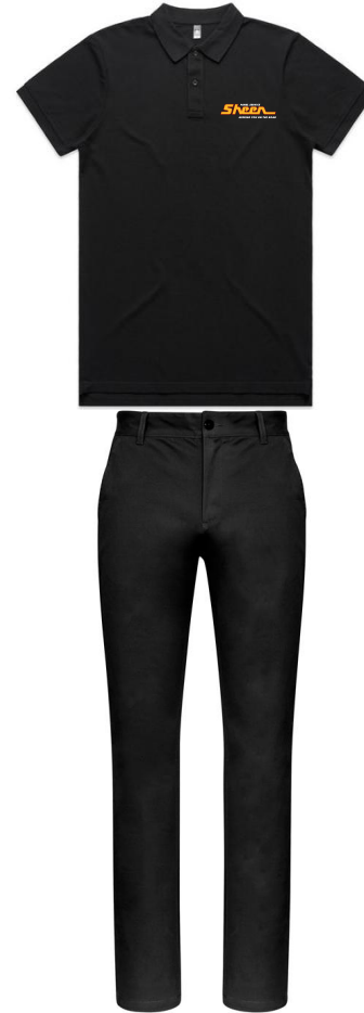
MEN'S PREMIUM HUNTER POLO