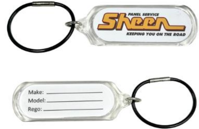
SHEEN REPLACEMENT VEHICLE KEY TAGS