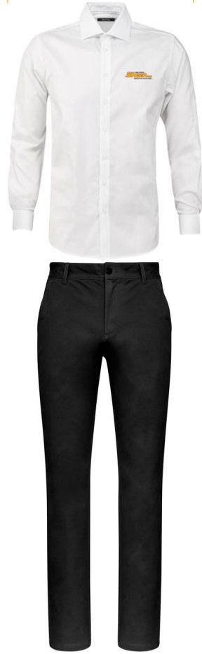
PREMIUM MEN'S DEXTER OXFORD SHIRT