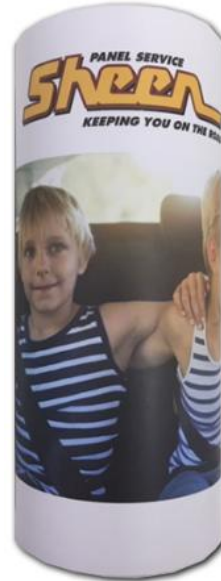
SHEEN TISSUE CYLINDERS