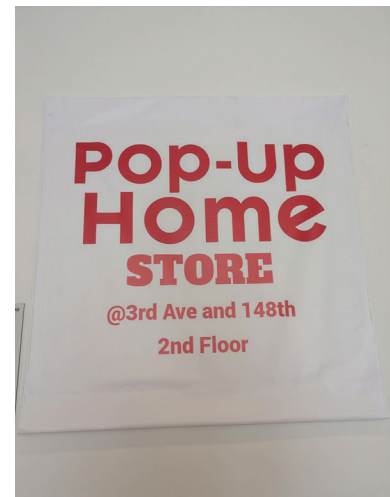
Pop-Up Home Store 2825 Third Ave, 2nd Fl.