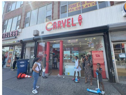
Carvel 2855 Third Ave