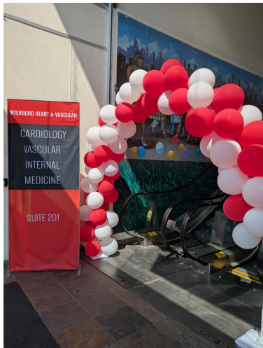
Interboro Heart & Vascular 2825 Third Ave, 2nd Fl.