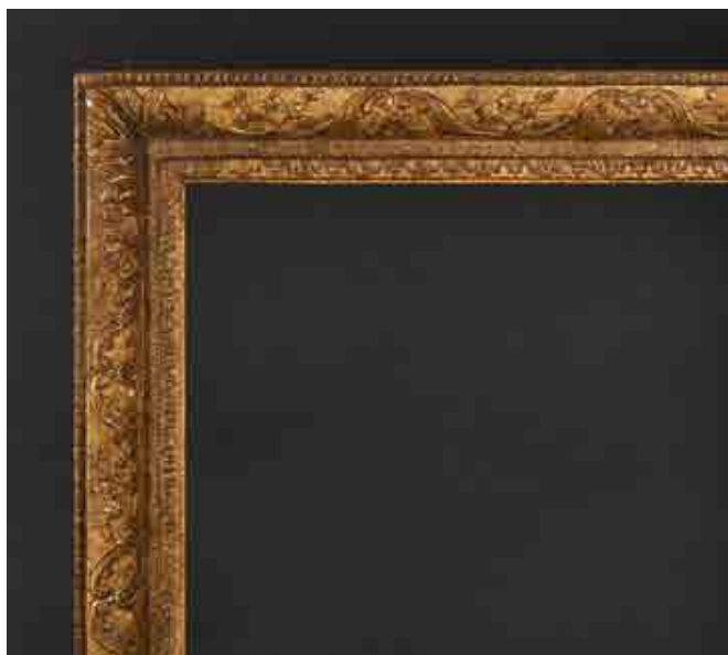
286. 20th Century English School A Gilt Composition Frame, rebate 46.5" x 34" (118.1 x 86.3cm) £80-£120