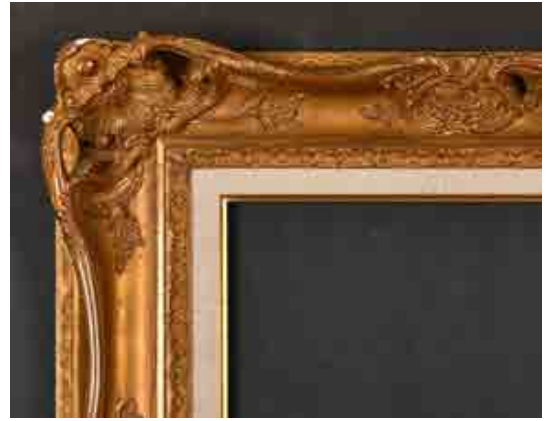
396. 20th Century French School A Louis Style Gilt Composition Frame with swept and pierced centers and corners and a fabric slip, rebate 21.75" x 13" (55.3 x 33cm), without slip 23.75" x 15" (60.3 x 38.1cm) £60-£80