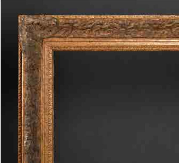
304. 20th Century English School A Gilt Composition Frame with swept centres and corners, rebate 36" x 29.5" (91.5 x 74.9cm) £50-£80