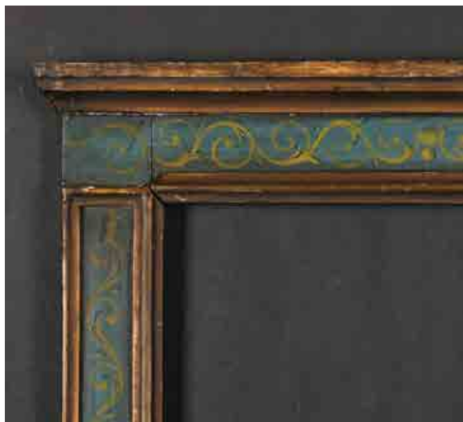
410. 19th Century European School A Gilt and Painted Composition Tabernacle Frame, rebate 19.25" x 13" (48.8 x 33cm) £200-£300