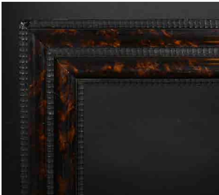
337. 19th Century English School A Black Frame, with simulated tortoiseshell, rebate 29.75" x 25.5" (75.6 x 64.8cm) £300-£400