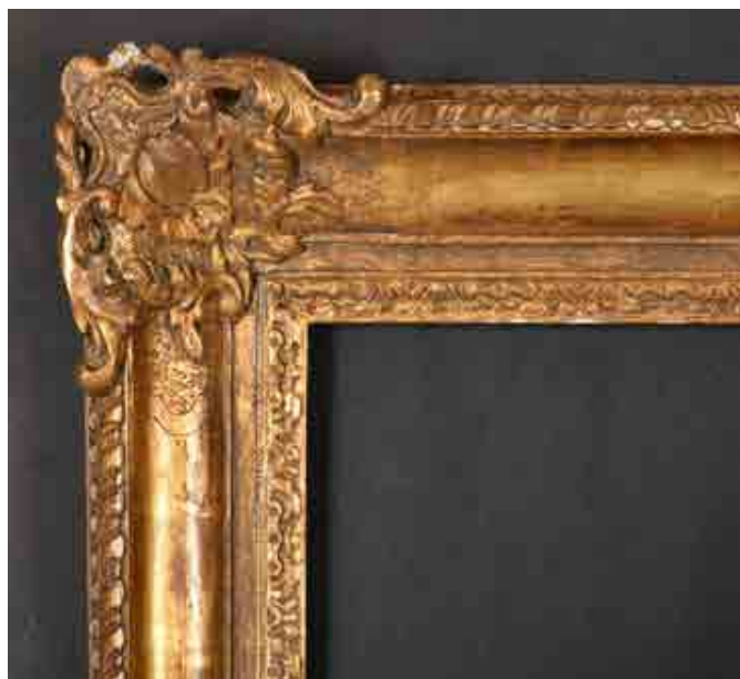
411. 20th Century French School A Louis Style Carved Giltwood Frame with swept and pierced corners, rebate 19" x 14.25" (48.2 x 36.2cm) £100-£150