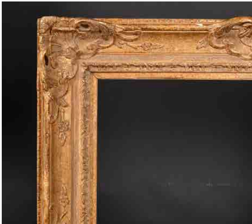
317. 20th Century French School A Louis Style Gilt Composition Frame, with swept and pierced centres and corners, rebate 32" x 26" (81.3 x 66cm), without slip, rebate 33.25" x 27" (84.4 x 68.6cm) £100-£200