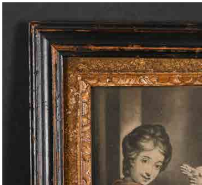
458. 18th Century English School A Darkwood Frame, with a carved giltwood slip, with inset print and glass, rebate 6.5" x 5" (16.5 x 12.7cm) £50-£80