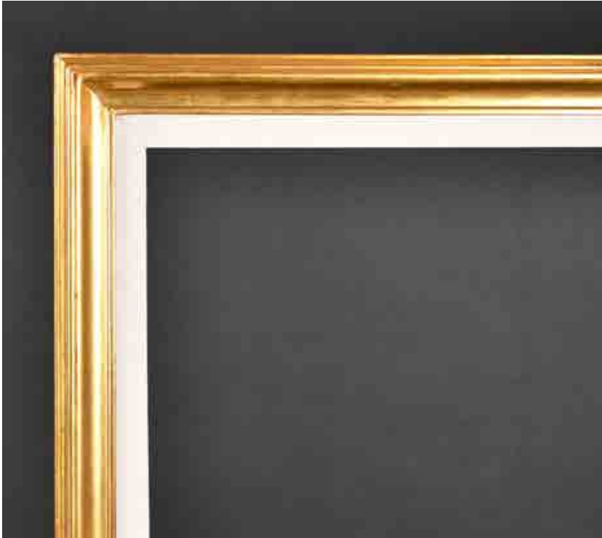
281. 20th Century English School A Gilt Composition Frame, with a fabric slip, rebate 52.5" x 39" (158.7 x 99.1cm), without slip, rebate 54.75" x 41" (139.1 x 104.2cm) £80-£120