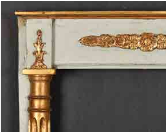
431. Early 20th Century English School A Painted Temple Frame, rebate 16.25" x 12.5" (41.3 x 31.8cm) £50-£80