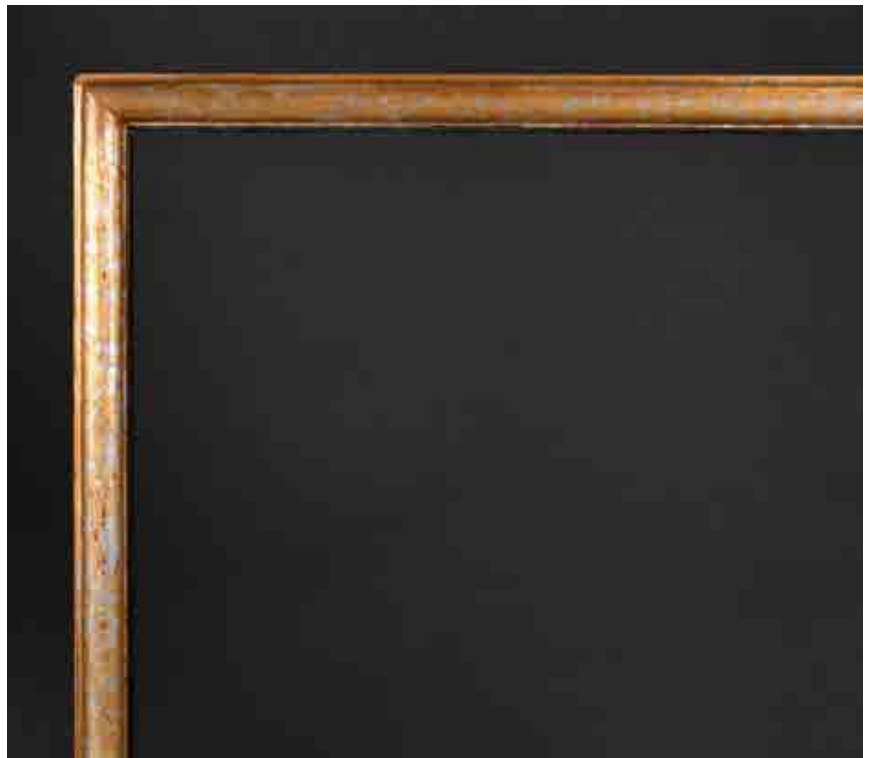
282. 20th Century European School A Gilt Composition Frame, rebate 51.5" x 43.25" (130.9 x 109.7cm) £50-£80