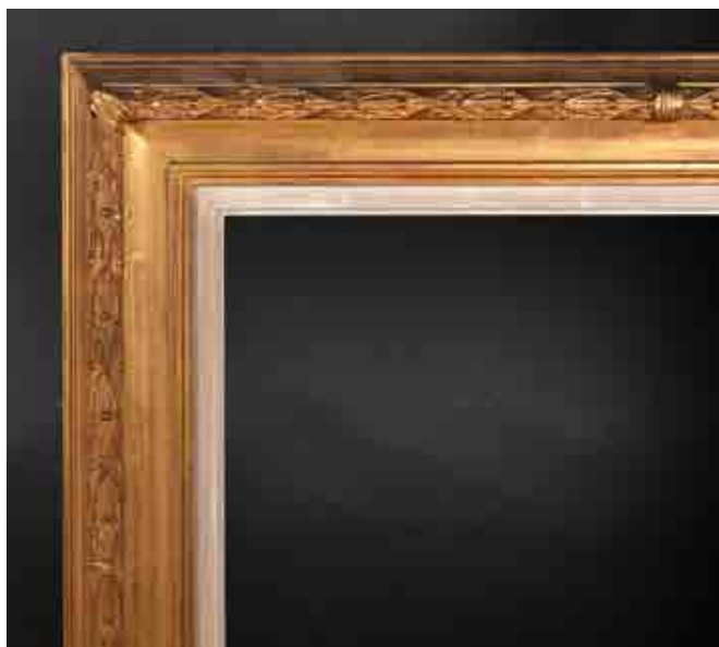
316. 19th Century English School A Gilt Composition Frame, with a painted slip, rebate 32.5" x 25.75" (82.5 x 65.4cm) £50-£80