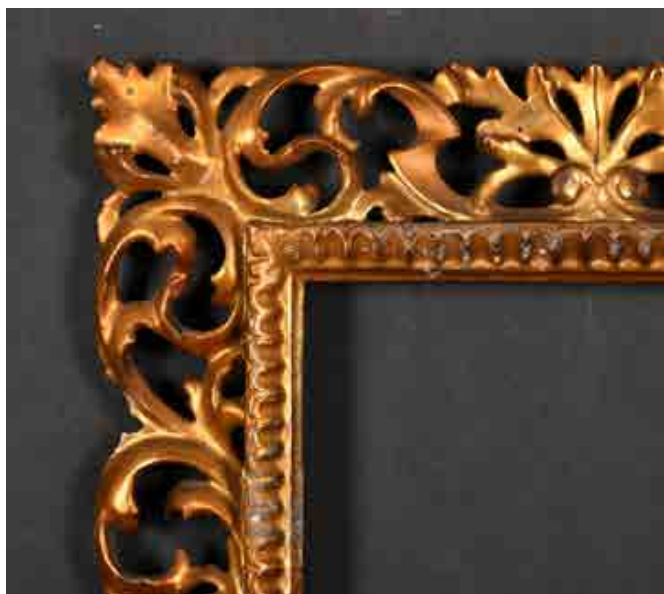
448. 19th Century Italian School A Carved Giltwood Florentine Frame, rebate 13.25" x 8.25" (33.7 x 21cm) £60-£80