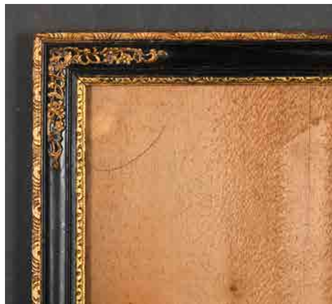
414. 18th Century English School A Hogarth Style Frame, with metal decorated corners and inset glass, rebate 18.5" x 14.25" (47 x 36.2cm) £60-£80