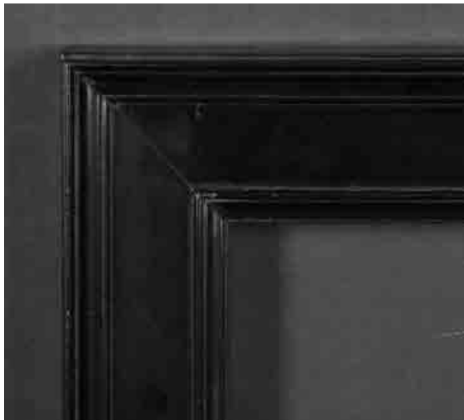
456. 20th Century European School A Black Composition Frame, rebate 7" x 4.75" (17.8 x 12.1cm) £50-£80