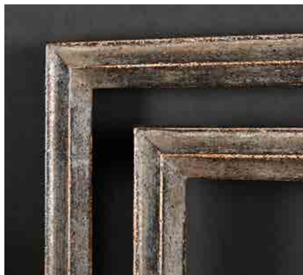
454. 20th-21st Century English School A Pair of Silver Gilt Composition Frames, rebate 9.75" x 7.75" (24.7 x 19.7cm) (2) £80-£120