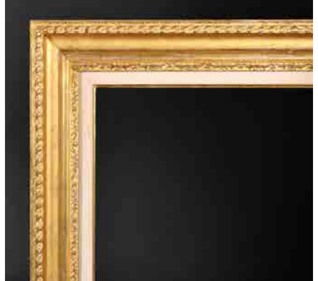
305. 20th Century English School A Gilt Composition Frame with a fabric slip, rebate 36" x 29" (91.5 x 73.7cm) without slip 38.5" x 31" (97.8 x 78.8cm) £80-£120