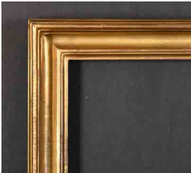
409. Early 19th Century English School A Hollow Gilt Composition Frame, rebate 19.25" x 13.25" (48.8 x 33.7cm) £80-£120