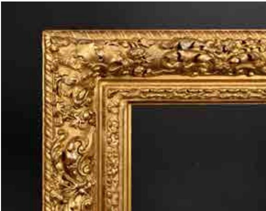
355. 19th Century European School A Painted Carved Wood Frame, rebate 27.5" x 22" (69.9 x 55.8cm) £50-£80