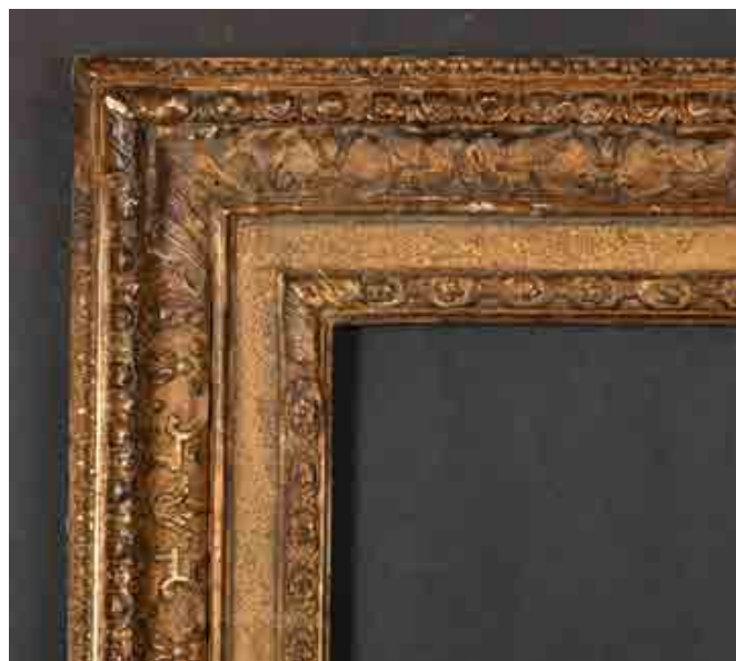
408. 19th Century French School A Carved Giltwood Frame, rebate 20" x 13.5" (50.8 x 34.2cm) £100-£150