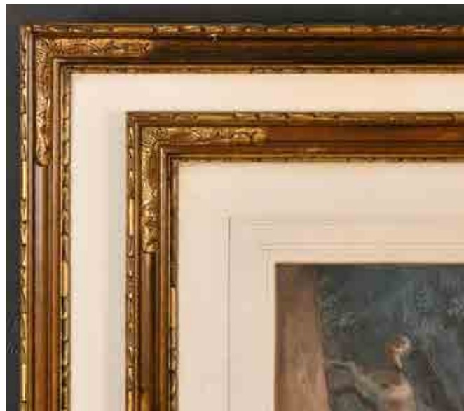
406. 20th Century English School A Pair of Gilt and Painted Composition Frames with inset print and glass, rebate 20" x 16.75" (50.8 x 42.5cm) £50-£80