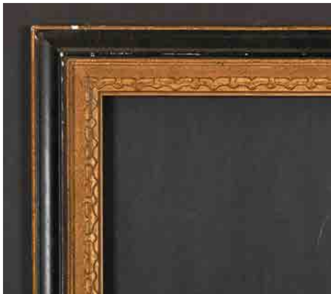
376. Late 18th Century English School A Black and Gilt Composition Frame, rebate 24" x 20" (61 x 50.8cm) £60-£80