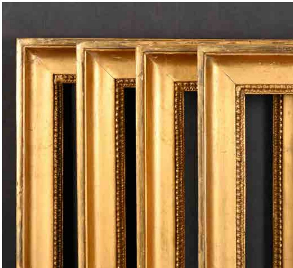
453. Early 19th Century English School A Set of Four Gilt Composition Frames, rebate 9.75" x 8" (24.7 x 20.3cm) (4) £200-£300