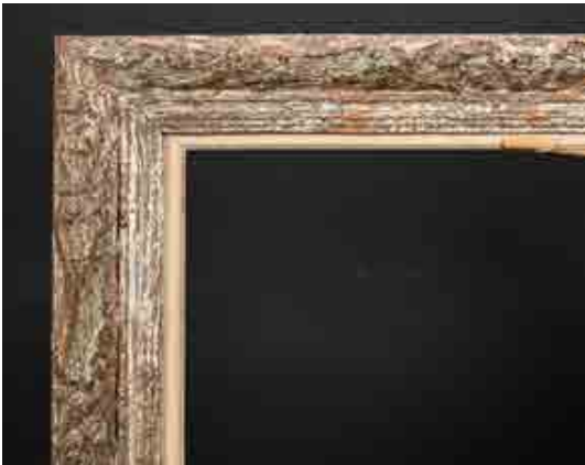
341. 20th Century French School A Painted Carved Wood Frame, with a white slip, rebate 29" x 23.5" (73.7 x 47cm), without slip rebate 30.5" x 25.5" (77.4 x 64.7cm) £100-£150