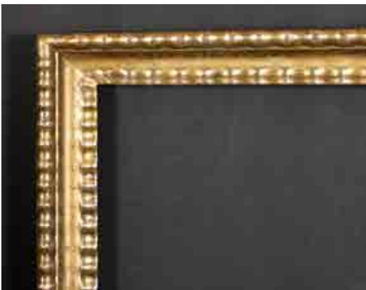
433. 20th Century English School A Gilt Composition Ripple Frame, rebate 16" x 13.25" (40.6 x 33.7cm) £80-£120