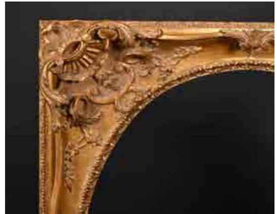
342. 20th Century European School A Gilt Composition Frame with an oval inset with swept and pierced centres and corners, rebate 29" x 23.25" (73.7 x 59.1cm) £60-£80