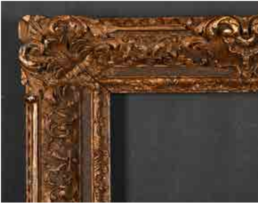
429. 20th Century French School A Louis Style Gilt Composition Frame with swept centres and corners, rebate 16.5" x 10.25" (41.9 x 26cm) £60-£80