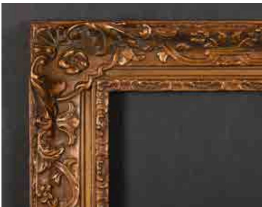
444. 19th Century English School A Gilt Composition Frame with swept corners, rebate 14" x 12" (35.5 x 30.5cm) £50-£80