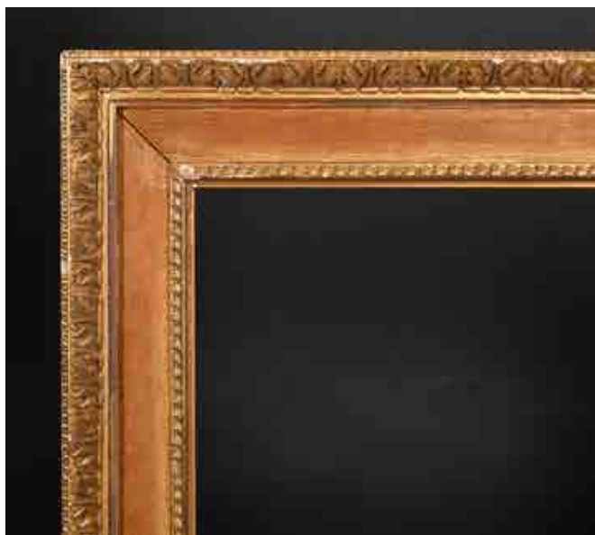
322. 19th Century English School A Gilt and Painted Watts Composition Frame, rebate 30.25" x 25" (76.8 x 63.5cm) £60-£80