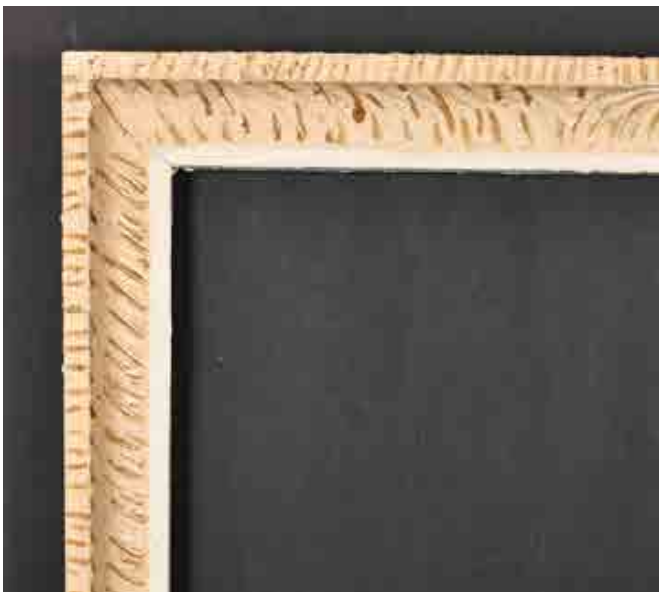
403. 20th Century French School A Painted Composition Frame, rebate 21" x 15.75" (53.3 x 40cm) £50-£80