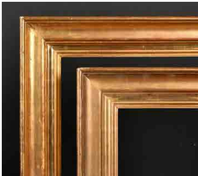
350. 19th Century European School A Pair of Gilt Composition Frames, rebate 28.25" x 24.75" (71.7 x 62.8cm) (2) £100-£200