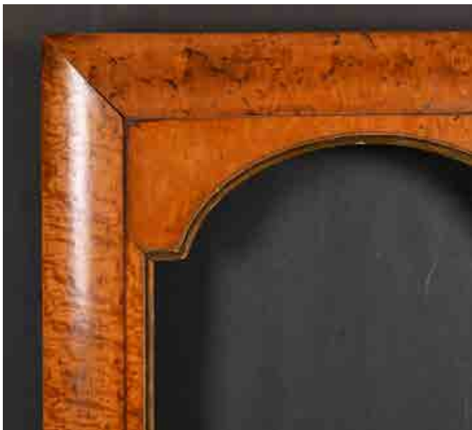
390. 19th Century English School A Cushioned Maple Frame, with an arched maple slip, rebate 22.5" x 15.25" (57.2 x 38.7cm) £80-£120