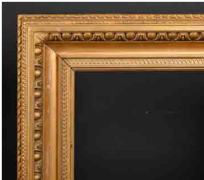
359. 19th Century English School A Gilt Composition Frame, rebate 27" x 22.75" (68.6 x 57.8cm) £100-£200