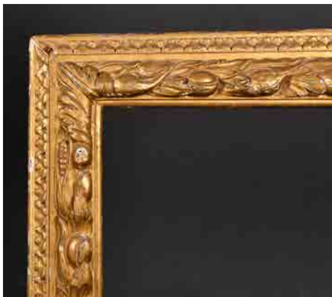
315. Early 19th Century English School A Carved Giltwood Frame, rebate 33.5" x 29" (85.1 x 73.7cm) £200-£400