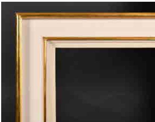
329. 20th Century English School A Painted Composition Frame with gilt edging, rebate 30" x 25" (76.2 x 63.5cm) £50-£80