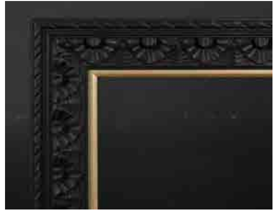
354. 20th Century English School A Black Painted Carved Wood Frame, with a gilt slip, rebate 27.75" x 20.25" (70.5 x 51.4cm) £50-£80