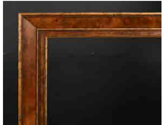
356. 20th Century European School A Wooden Frame, with gilt edging, rebate 27.5" x 21.5" (69.8 x 54.6cm) £50-£80