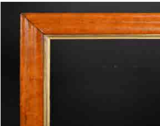
343. 19th Century English School A Maple Frame with a gilt slip, rebate 29" x 23" (73.7 x 58.4cm) £50-£80