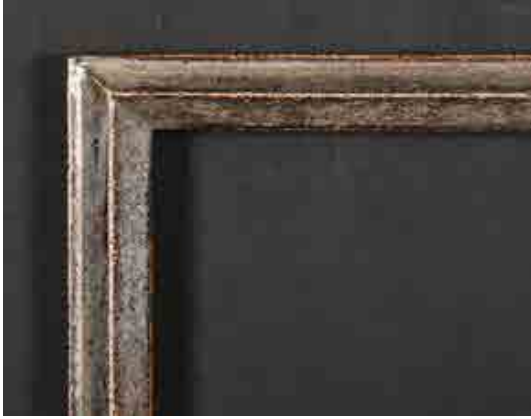
441. 20th-21st Century English School A Silver Composition Frame, rebate 14.75" x 11.75" (37.4 x 29.8cm) £50-£80