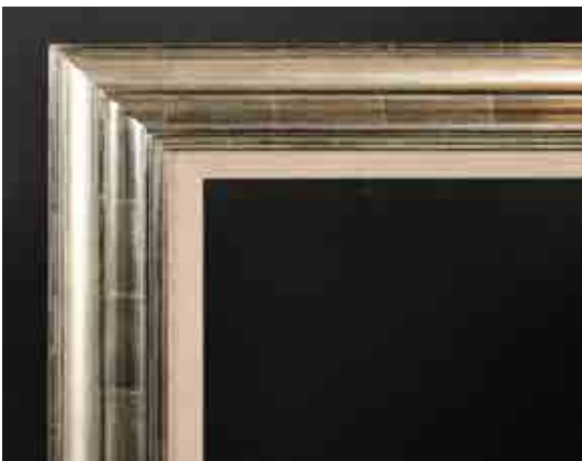
373. 20th Century English School A Silver Composition Frame, with a fabric slip, rebate 24.5" x 20.5" (62.2 x 52.1cm), without slip, rebate 26.5" x 22.5" (67.3 x 57.2cm) £60-£80