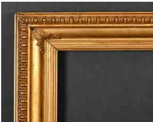
427. 19th Century English School A Gilt Composition Frame, rebate 16.5" x 12.5" (41.9 x 31.7cm) £50-£80