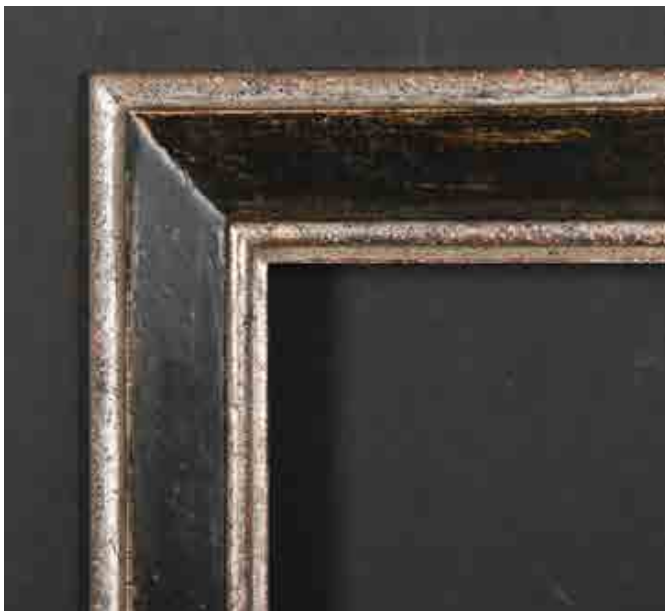
452. 20th-21st Century English School A Black Painted Frame, with silver inner and outer edges, rebate 10.25" x 8.5" (26 x 21.6cm) £60-£80