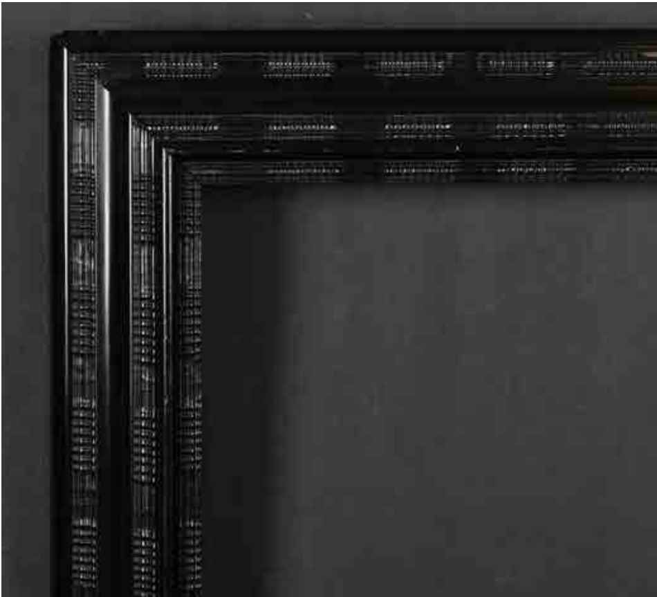
417. 20th Century English School A Black Rippled Frame, rebate 18" x 16" (45.7 x 40.6cm) £200-£300