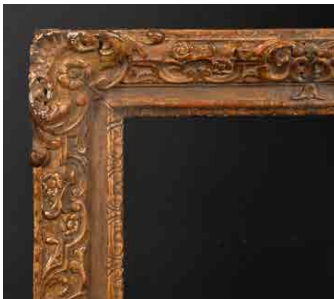
321. 20th Century European School A Carved Giltwood frame with swept and pierced centres and corners, rebate 30.5" x 15.5" (77.4 x 39.4cm) £60-£80