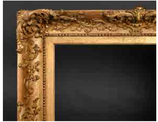
327. 19th Century English School A Gilt Composition Frame, with swept centres and corners, rebate 30" x 25" (76.2 x 63.5cm) £80-£120