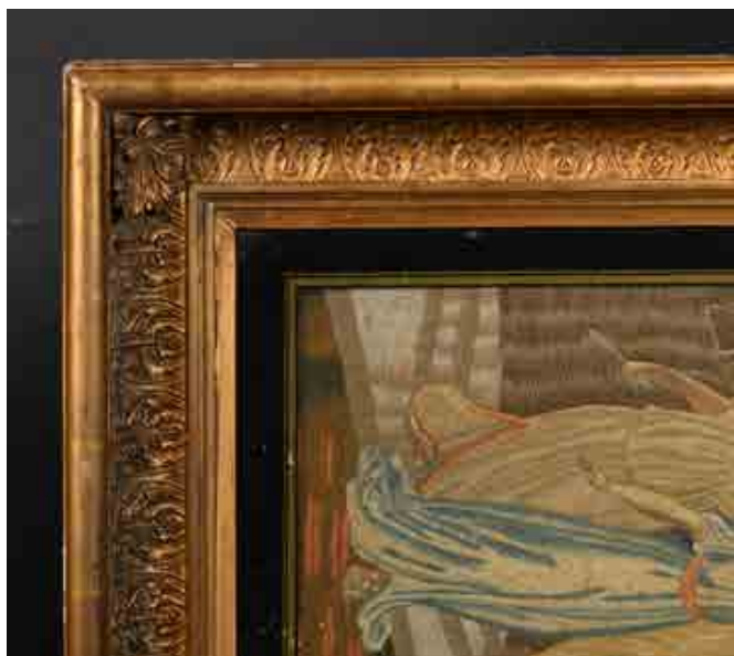
377. Early 19th Century English School A Gilt Composition Frame, with inset tapestry and eglomise glass, rebate 24" x 19.5" (61 x 49.5cm) £100-£150