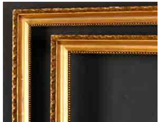
358. Early 19th Century English School A Pair of Gilt Composition Frames, rebate 27" x 23.25" (68.6 x 59cm) (2) £80-£120