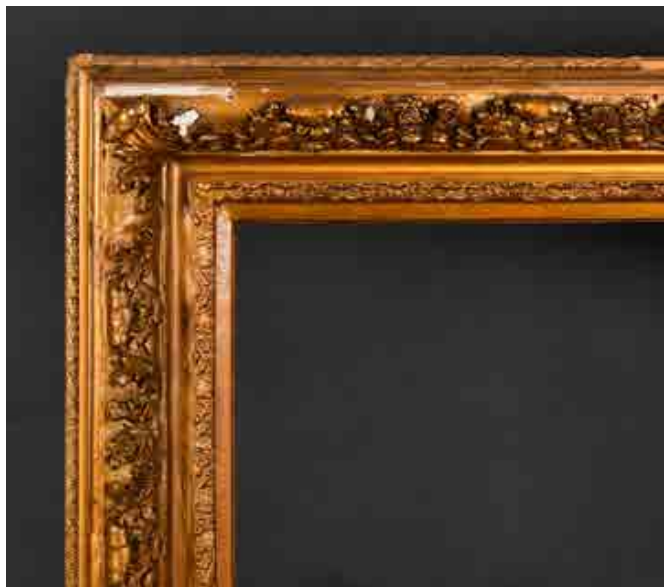
293. 19th Century French School A Painted Barbizon Composition Frame, rebate 39.5" x 31.5" (100.3 x 80cm) £50-£80