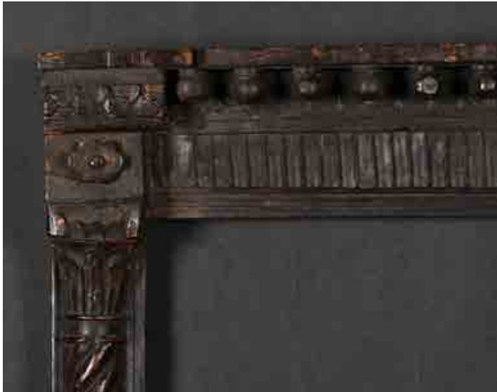
424. 19th Century English School A Wooden Tabernacle Frame, rebate 17" x 11" (43.2 x 27.9cm) £200-£300