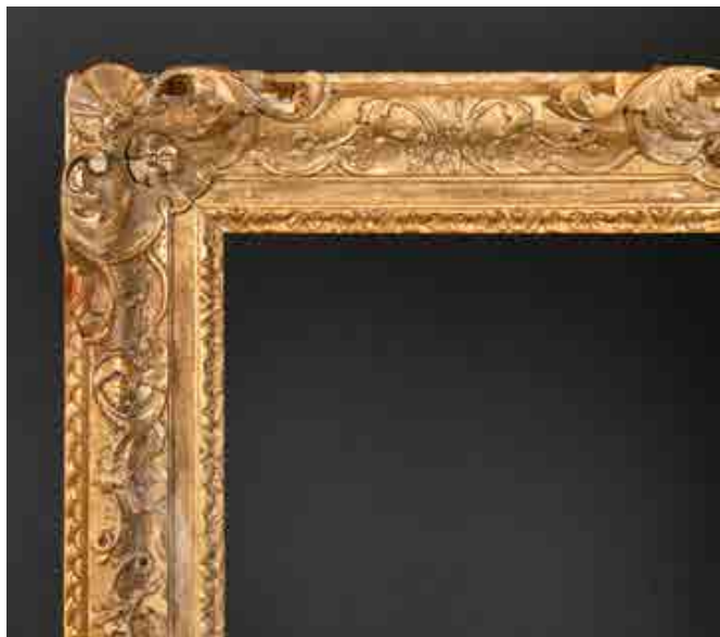
297. Late 18th Century English School A Carved Giltwood Frame with swept and pierced centres and corners, rebate 37.75" x 25.25" (95.8 x 64.2cm) £300-£400