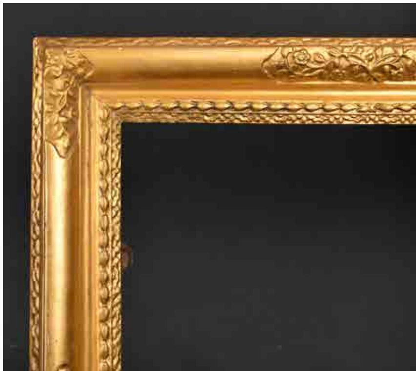
303. Early 19th Century English School A Carved Giltwood Frame, with Lely panels, rebate 36" x 30" (91.5 x 76.2cm) £200-£300