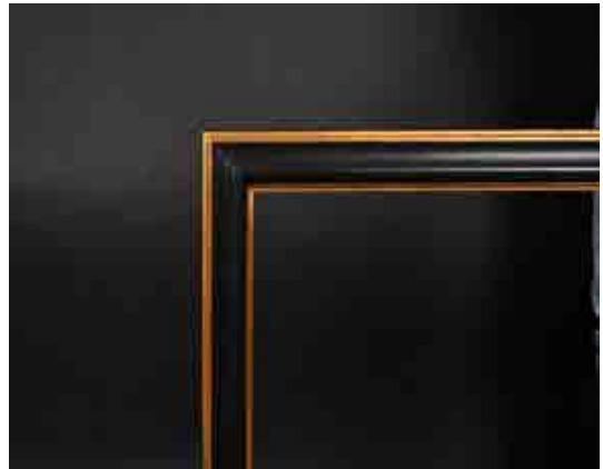
372. 20th Century English School A Black Painted Frame, with gilt inner and outer edges, rebate 24.75" x 20.75" (62.8 x 52.7cm) £80-£120