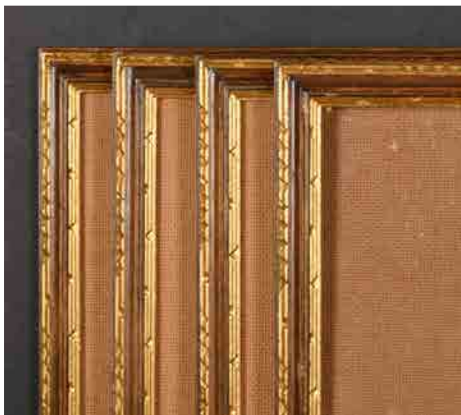
449. 20th Century English School A Set of Four Gilt and Painted Composition Frames, rebate 13" x 11.25" (33 x 28.6cm) £60-£80