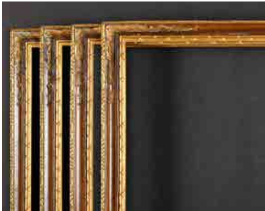
385. 20th Century English School A Set of Four Ornate Wooden Frames, with gilt inner and outer edges, rebate 23.5" x 19.5" (59.7 x 49.5cm) (4) £100-£200