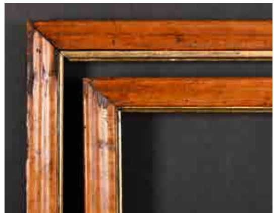
428. 19th Century English School A Near Pair of Maple Frames, with gilt slips, rebate 16.5" x 12.5" (41.9 x 31.7cm) (2) £50-£80