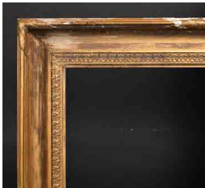
325. Early 19th Century English School A Gilt Composition Hollow Frame, rebate 30" x 25" (76.2 x 63.5cm) £100-£200