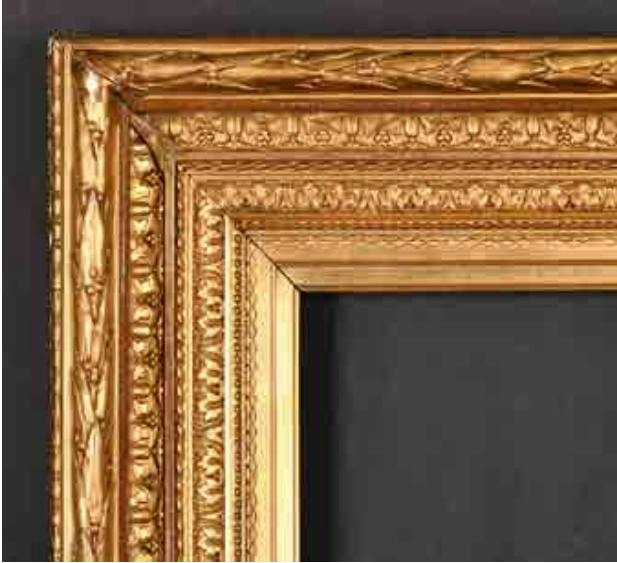
415. 19th Century English School A Gilt Composition Frame, rebate 18.5" x 12.75" (47 x 32.4cm) £80-£120