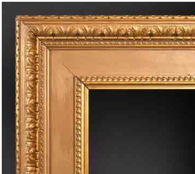
334. 19th Century English School A Gilt and Painted Composition Watts Frame, rebate 30" x 20" (76.2 x 50.8cm) £70-£100