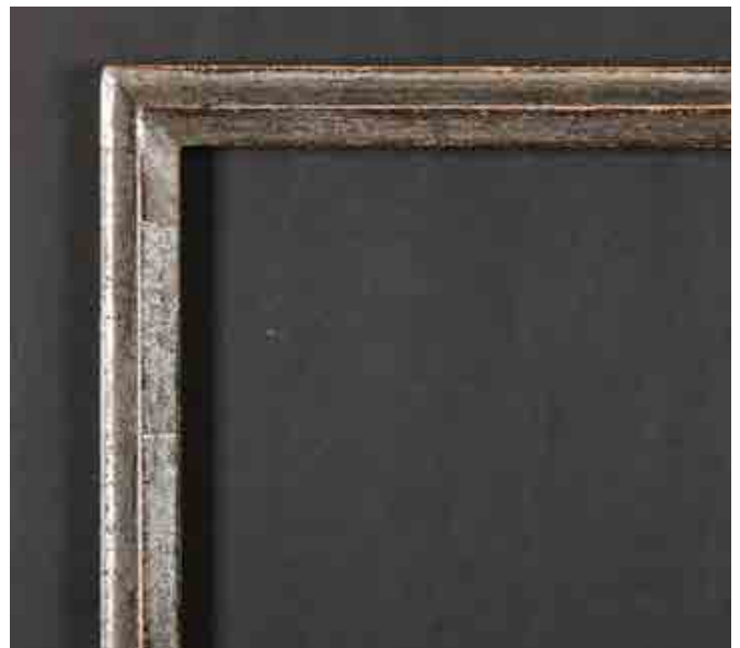
404. 20th-21st Century English School A Silver Composition Frame, rebate 20.75" x 16.75" (52.7 x 42.5cm) £60-£80