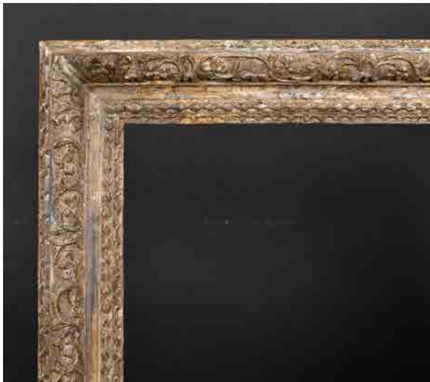
332. 18th Century English School A Fine Silver Carved Wood Frame, rebate 30" x 24.5" (76.2 x 62.2cm) £400-£600