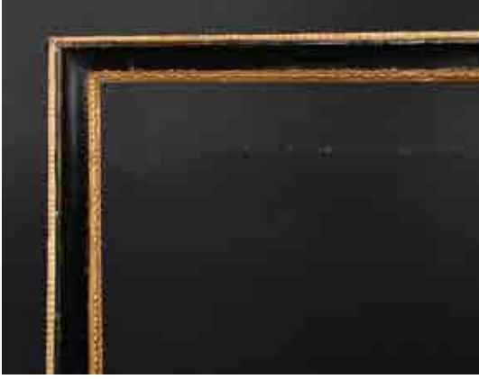
339. Early 19th Century English School A Hogarth Style Frame, rebate 29.25" x 20.75" (74.3 x 52.7cm) £50-£80