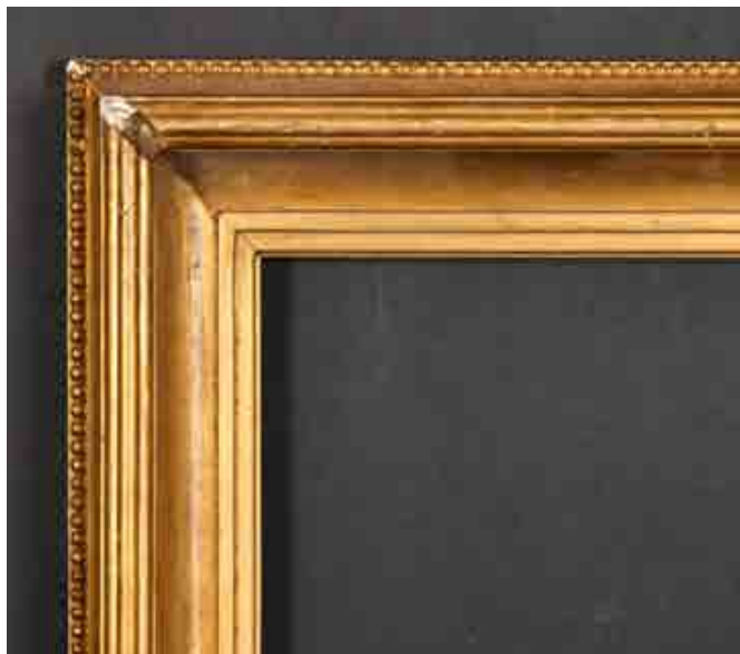
446. 19th Century English School A Gilt Composition Hollow Frame, rebate 13.5" x 11.5" (34.2 x 29.2cm) £50-£80