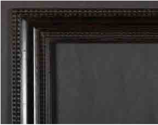
395. 20th Century English School A Darkwood Rippled Frame, rebate 22" x 15" (55.8 x 38.1cm) £80-£120