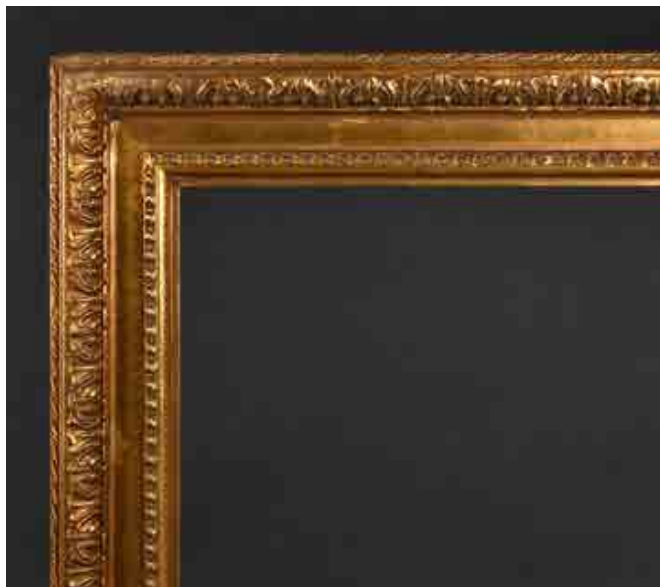
284. 19th Century English School A Watts Style Gilt Composition Frame, rebate 50" x 40" (127 x 101.7cm) £100-£150