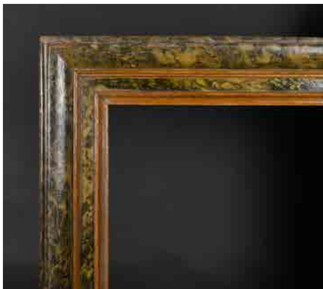
295. 19th Century Italian School A Painted Composition Frame, rebate 39" x 26" (99.1 x 66cm) £100-£200