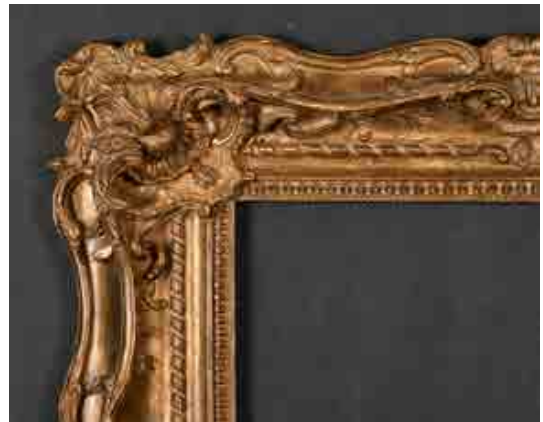
426. 19th Century French School A Gilt Composition Frame, rebate 16.5" x 13.5" (41.9 x 34.3cm) £80-£120