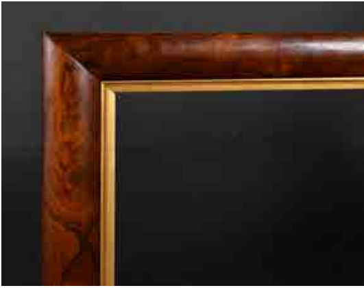
353. 19th Century English School A Cushioned Darkwood Frame, with a gilt slip, rebate 28" x 23.25" (71.1 x 59.1cm) £50-£80