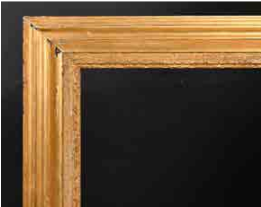
365. Early 19th Century English School A Gilt Composition Hollow Frame, rebate 26" x 21.25" (66 x 54cm) £50-£80