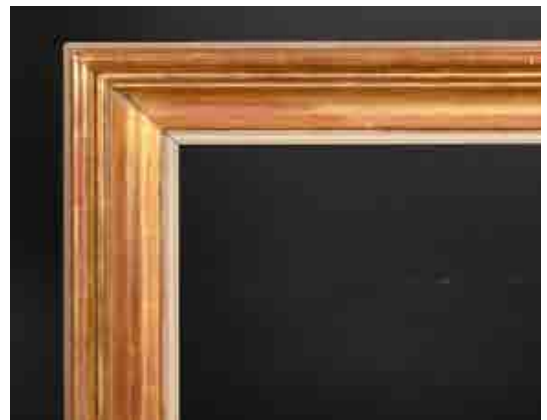
330. 20th Century English School A Gilt Composition Hollow Frame, with a painted inner edge, rebate 30" x 25" (76.2 x 63.5cm) £80-£120