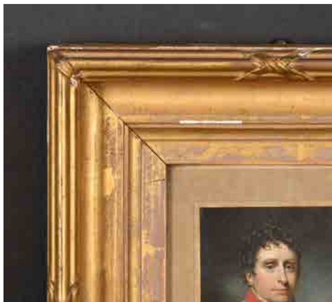
457. Early 19th Century English School A Fine Gilt Composition Hollow Frame with inset print and glass, rebate 6.75" x 5.5" (17.2 x 14cm) £50-£80