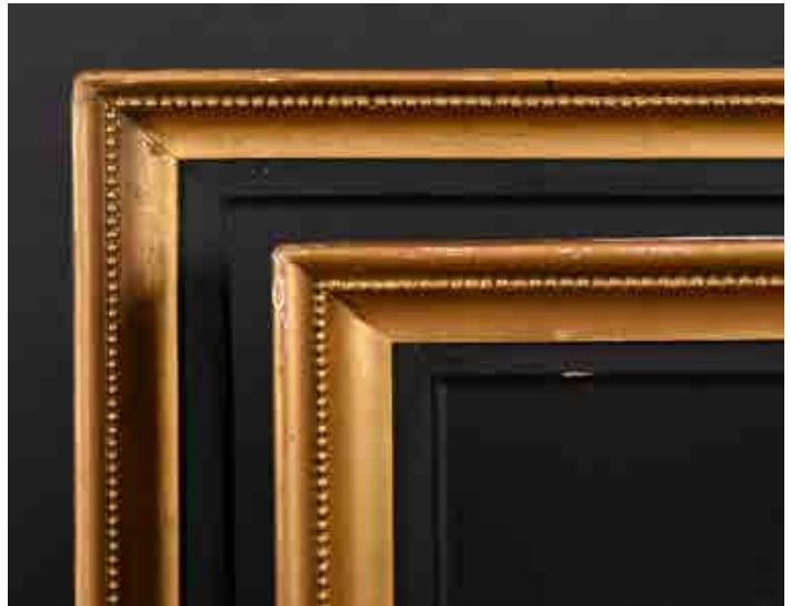
328. 19th Century English School A Pair of Hollow Gilt Composition Frames, with black inner edging, rebate 30" x 25" (76.2 x 63.5cm) £150-£250