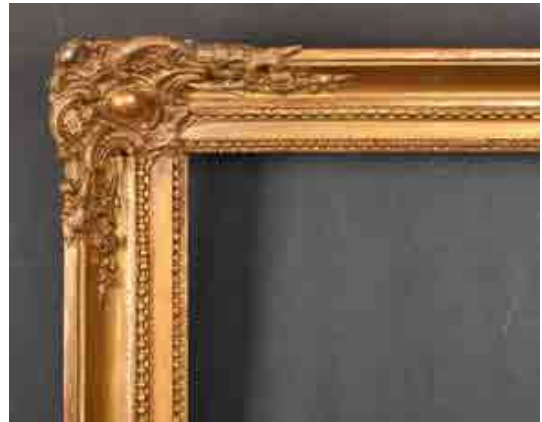
386. 19th Century French School A Gilt Composition Frame, with swept corners, rebate 23.5" x 18.5" (59.7 x 47cm) £50-£80