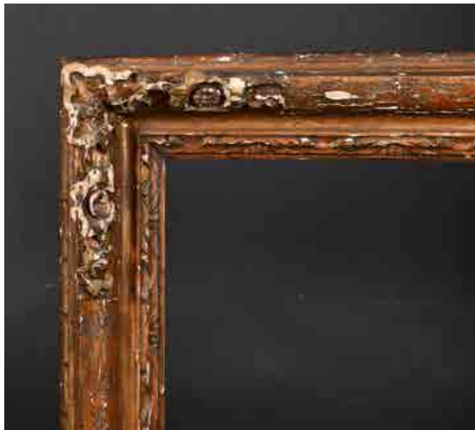
323. Late 19th Century English School A Gilt and Painted Carved Wood Frame, with swept and pierced corners, rebate 30" x 25.25" (76.2 x 64.2cm) £100-£150