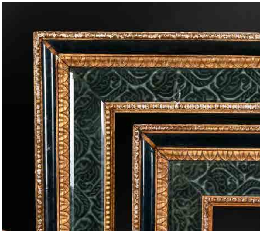
318. 19th Century European School A Pair of Carved Giltwood Frames, with central glass panels, rebate 32" x 24" (81.3 x 61cm) (2) £300-£500