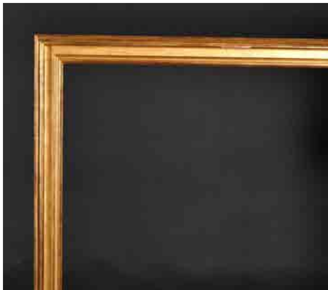
283. 20th Century English School A Gilt Composition Frame, rebate 50.5" x 38.75" (128.2 x 98.4cm) £100-£150