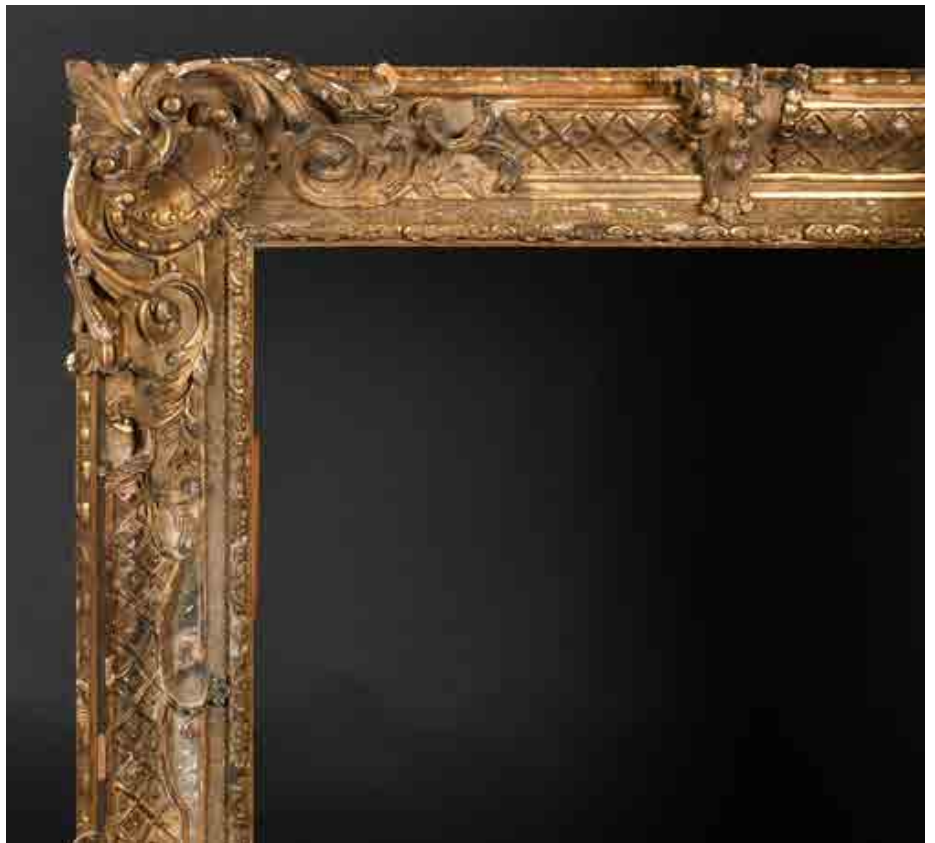
292. 19th Century French School A Louis Style Carved Giltwood Frame, with swept centres and corners, rebate 40" x 29" (101.6 x 73.8cm) £300-£500