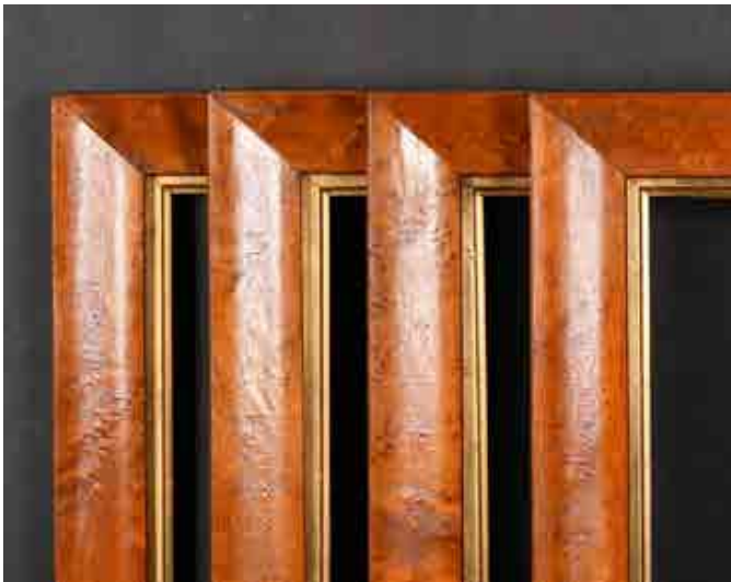
443. 20th Century English School A Set of Four Maple Frames, with gilt slips, rebate 14.5" x 11.25" (36.8 x 28.6cm) and another 19th Century English School A Maple Frame, with a silver slip, rebate 13.25" x 9.5" (33.6 x 24.1cm) (5) £100-£200