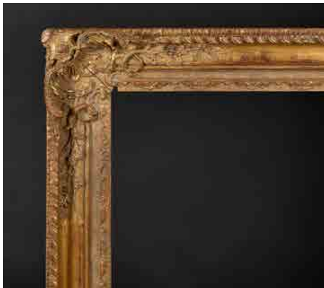
294. 20th Century English School A Gilt Composition Frame with swept corners, rebate 39.25" x 32.25" (99.7 x 81.8cm) £100-£150