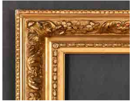
430. 19th Century French School A Barbizon Gilt Composition Frame, rebate 16.5" x 9" (41.9 x 22.8cm) £60-£80