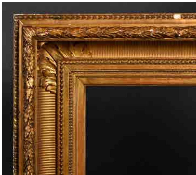
407. 19th Century English School A Gilt Composition Frame, rebate 20" x 14.5" (50.8 x 36.8cm) £100-£150