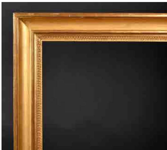
296. 20th Century European School A Gilt Composition Frame, rebate 38" x 27" (96.5 x 68.6cm) £50-£80