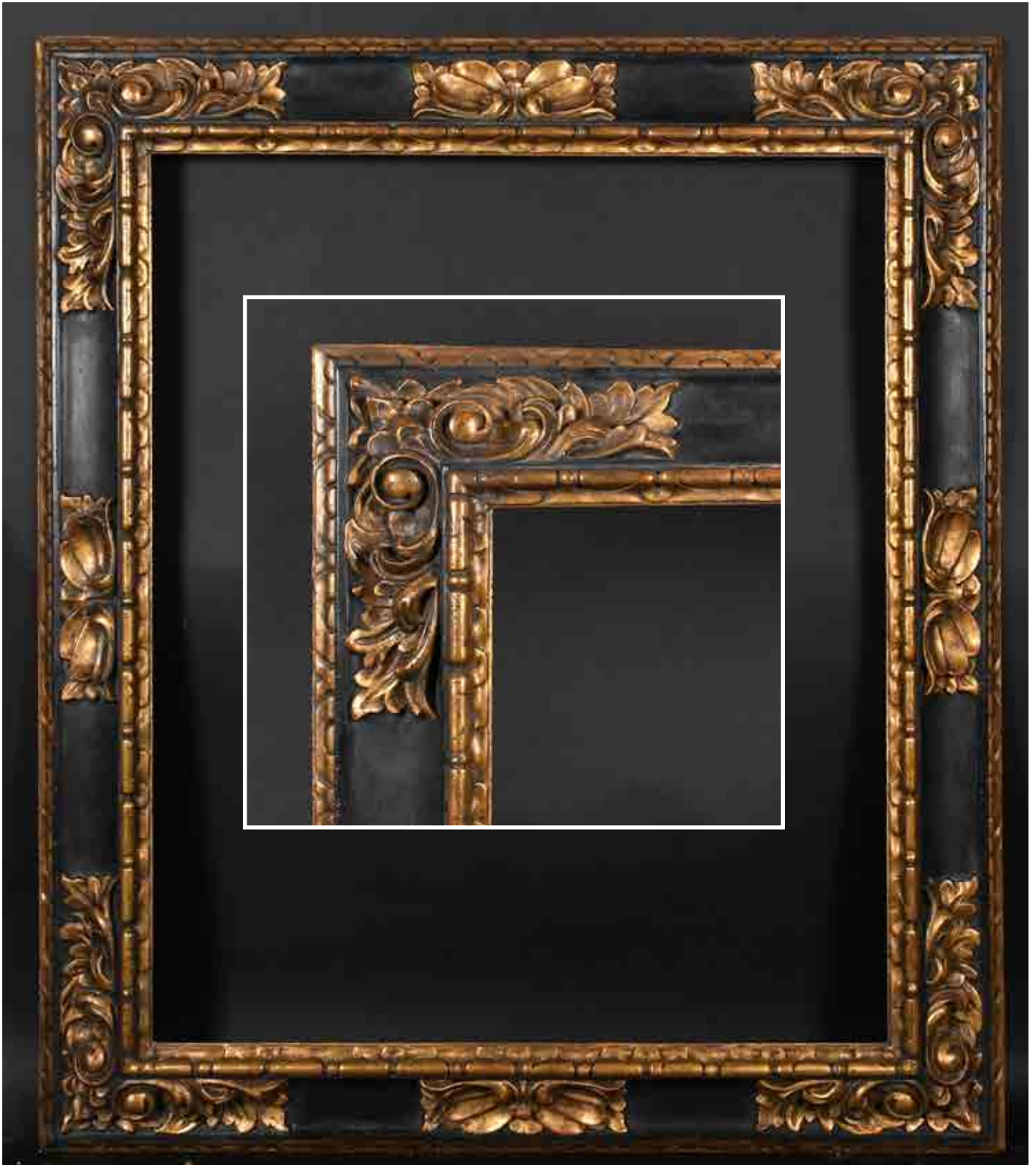
301. 20th Century European School A Carved Giltwood and Painted Frame, rebate 36.5" x 30.25" (92.7 x 76.8cm) £1000-£1500