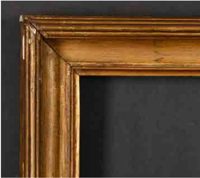
401. Early 19th Century English School A Gilt Composition Hollow Frame, rebate 21.25" x 17" (53.9 x 43.2cm) £100-£200