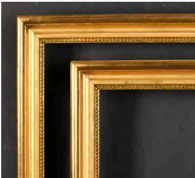
413. 19th Century English School A Fine Pair of Gilt Composition Hollow Frames, rebate 18.5" x 15.5" (47 x 39.4cm) (2) £200-£300