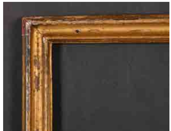
434. Late 18th Century English School A Gilt Composition Frame, rebate 16" x 12.5" (40.6 x 31.7cm) £60-£80