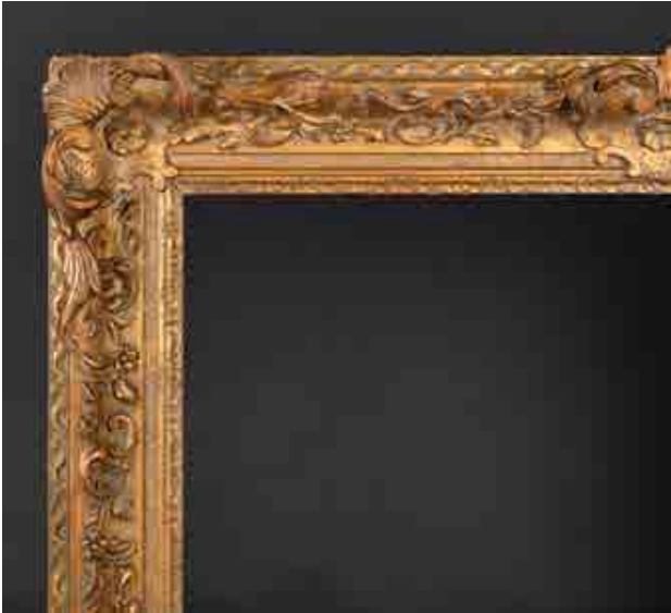
290. 19th Century English School A Gilt Composition Frame with swept centres and corners, rebate 40" x 30" (101.6 x 76.2cm) £60-£80