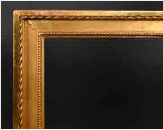
369. 19th Century European School A Gilt Composition Frame, rebate 25" x 20" (63.5 x 50.8cm) £50-£80