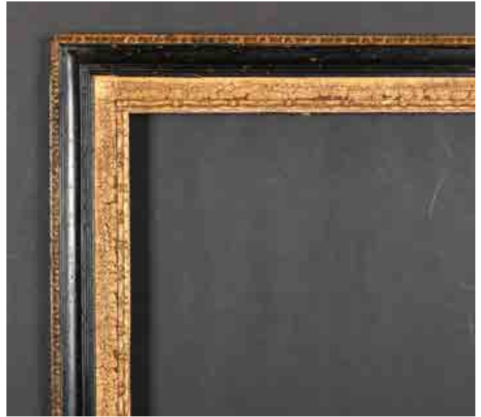
402. Late 18th Century English School A Hogarth Style Frame, rebate 21.25" x 15.75" (54 x 40cm) £80-£120