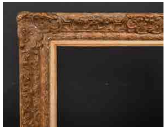
344. 20th Century French School A Louis Style Painted Composition Frame, with swept centres and corners and a fabric slip, rebate 29" x 21.5" (73.7 x 54.6cm), without slip rebate 30.75" x 23.25" (78.2 x 59.1cm) £80-£120