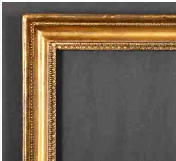
394. Early 19th Century English School A Gilt Composition Hollow Frame, rebate 22" x 17.75" (55.9 x 45.1cm) £80-£120