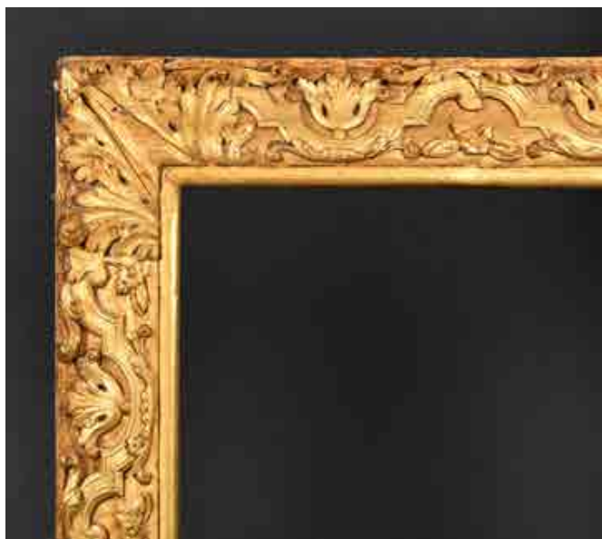
299. 19th Century European School A Gilt and Painted Carved Wood Frame, rebate 37" x 20" (94 x 50.8cm) £100-£200