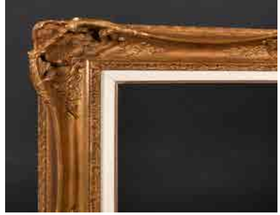
340. 20th Century French School A Louis Style Painted Composition Frame with swept and pierced centres and corners and a fabric slip, rebate 29" x 23.75" (73.7 x 60.3cm), without slip 30.75" x 27.75" (78.1 x 70.4cm) £50-£80