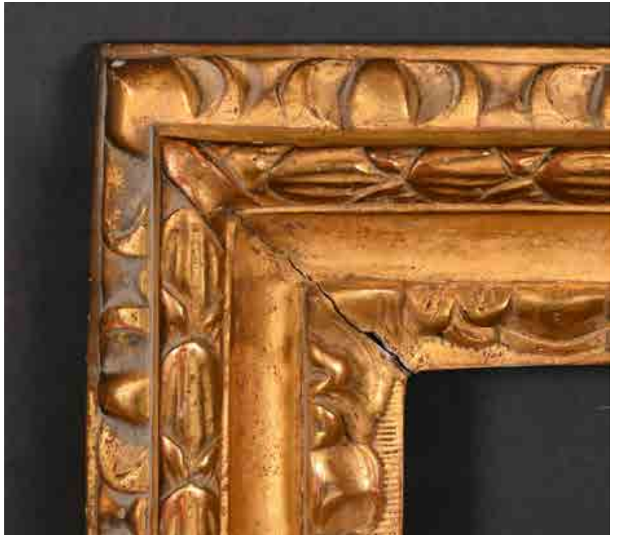
459. 18th Century Italian School A Carved Giltwood Frame, rebate 5" x 3.75" (12.7 x 9.5cm) £100-£150