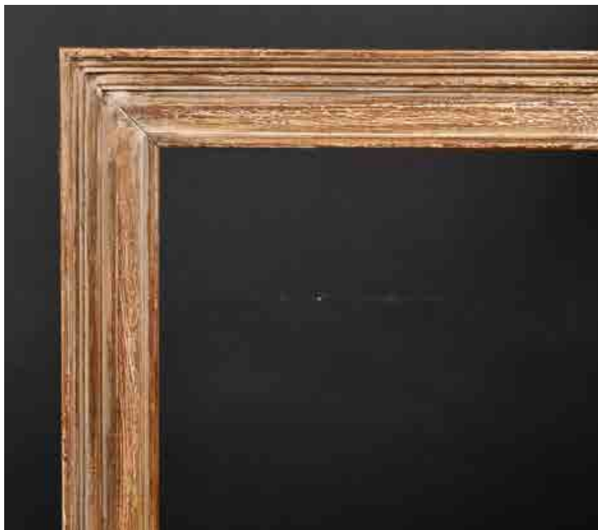
331. 20th Century English School A painted Bourlet Frame, rebate 30" x 25" (76.2 x 63.5cm) £100-£200