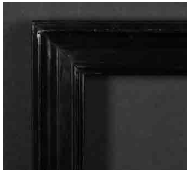
455. 20th Century European School A Black Composition Frame, rebate 7.5" x 6.25" (19.1 x 15.9cm) £50-£80