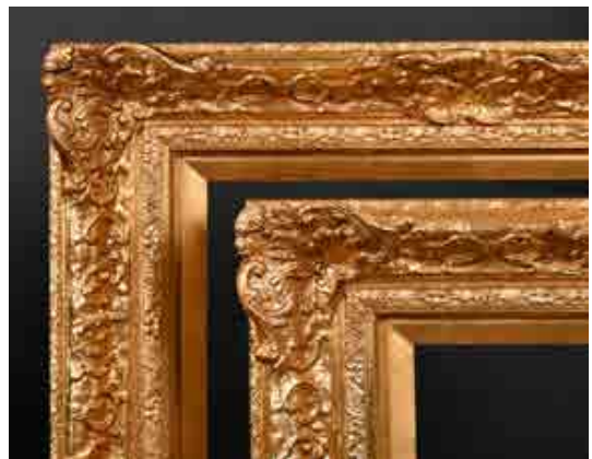
374. 20th-21st Century English School A Pair of Gilt Composition Frame with swept centres and corners, 24.5" x 14.5" (62.2 x 36.8cm) (2) £80-£120