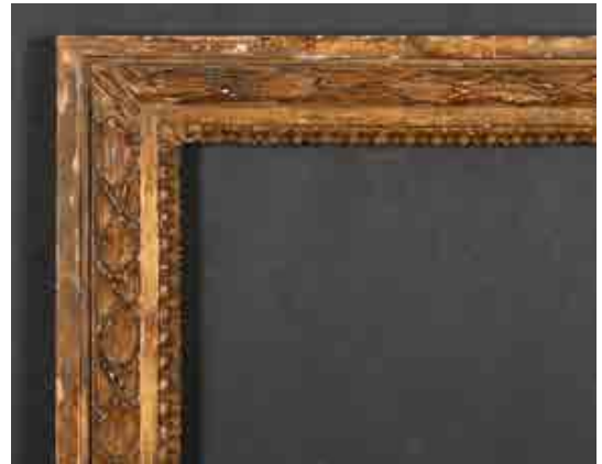
432. 19th Century English School A Gilt and Painted Darkwood Frame, rebate 16" x 13.25" (40.6 x 33.6cm) £80-£120