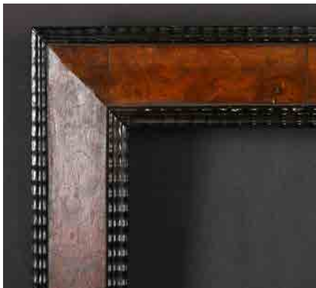
393. 20th Century European School A Wooden Inlaid Frame, with black rippled inner and outer edging, rebate 22" x 18" (55.8 x 45.7cm) £50-£80