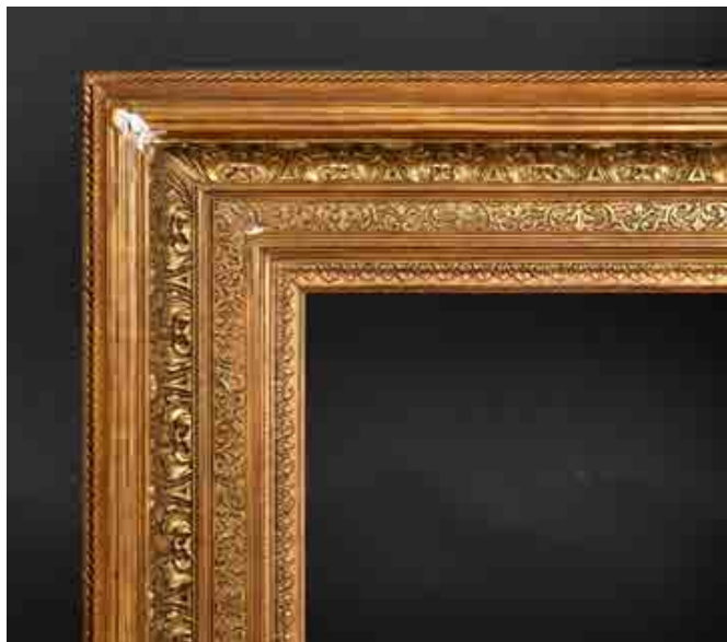
333. 19th Century English School A Gilt Composition Frame, rebate 30" x 23.75" (76.2 x 60.3cm) £50-£80