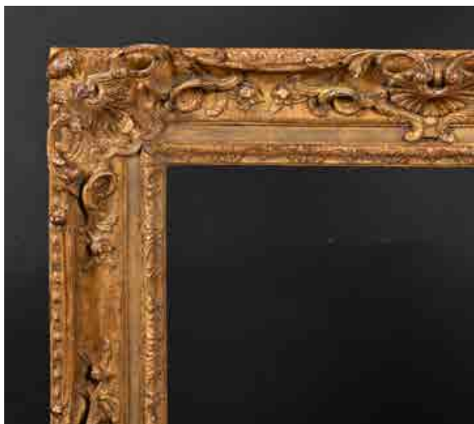
361. 19th Century French School A Louis Style Carved Giltwood Frame, with swept and pierced centres and corners, rebate 27" x 20" (68.6 x 50.8cm) £200-£300