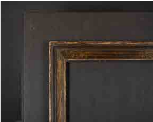
371. 20th Century European School A Wooden Frame with gilt inner and outer edges, rebate 25" x 16.25" (63.5 x 41.3cm) £80-£120