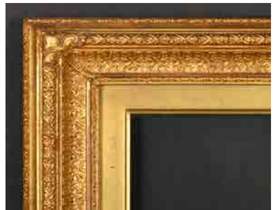
445. 19th Century English School A Gilt Composition Frame with inset glass, rebate 14" x 11.75" (35.5 x 29.8cm) £50-£80