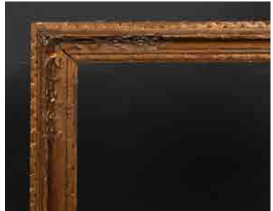
366. 19th Century English School A Gilt and Painted Carved Wood Frame, rebate 25.5" x 21.25" (64.7 x 54cm) £100-£200