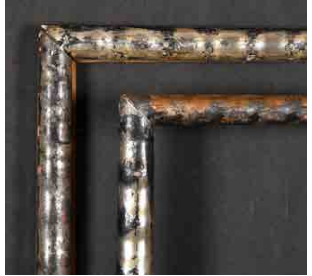
416. 19th Century English School A Pair of Silver Rippled Frames, rebate 18.5" x 12.25" (47 x 31.1cm) £60-£80