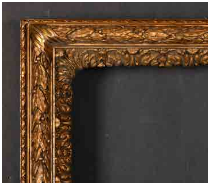
405. 19th Century English School A Gilt Composition Frame, rebate 20.5" x 18.25" (52.1 x 46.3cm) £50-£80