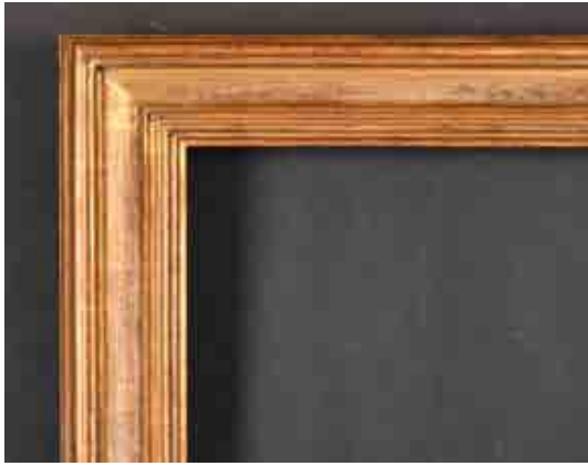
383. 20th Century English School A Gilt Composition Frame, rebate 23.75" x 19.25" (60.3 x 48.8cm) £80-£120