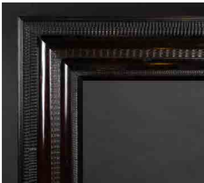
285. 20th Century Dutch School A Dutch Black Rippled Frame, rebate 48.5" x 39.75" (123.2 x 100.9cm) £300-£400