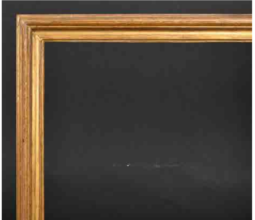
302. 18th Century Italian School A Plain Salvator Rosa Gilt Frame, rebate 36" x 31.5" (91.5 x 80cm) £300-£400