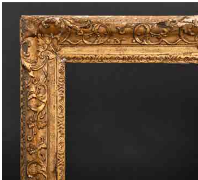
324. Late 18th Century English School A Carved Giltwood Frame with swept and pierced centres and corners, rebate 30" x 25" (76.2 x 63.5cm) £150-£200