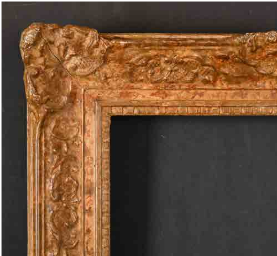
392. 20th Century French School A Fine Gilt and Painted Louis Style Composition Frame, with swept centres and corners, rebate 22.25" x 15.5" (56.5 x 39.4cm) £100-£200