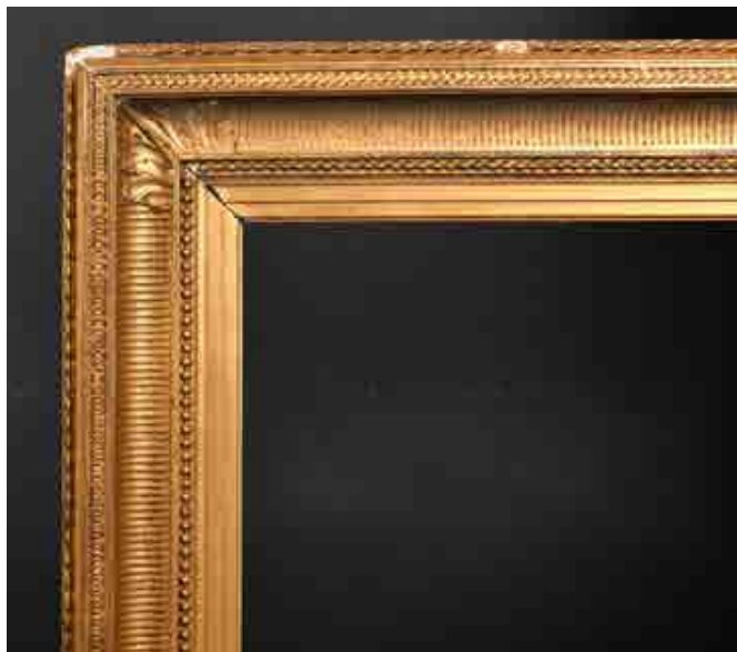
349. 19th Century English School A Gilt Composition Frame, rebate 28.5" x 23.25" (72.3 x 59.1cm) £100-£200