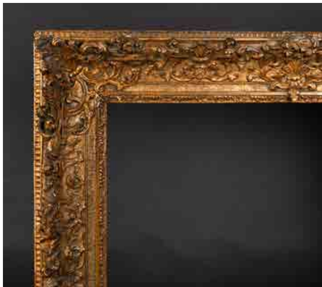
298. Late 18th Century French School A Louis Style Carved Giltwood Frame, with swept centres and corners, rebate 37.5" x 31" (95.2 x 78.8cm) £600-£800