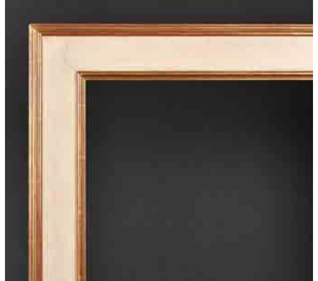
291. 20th Century English School A Gilt and Painted Composition Frame, rebate 40" x 30" (101.6 x 76.2cm) £50-£80