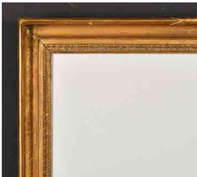
378. 19th Century English School A Hollow Gilt Composition Frame, with inset glass, rebate 24" x 19" (61 x 48.2cm) £60-£80