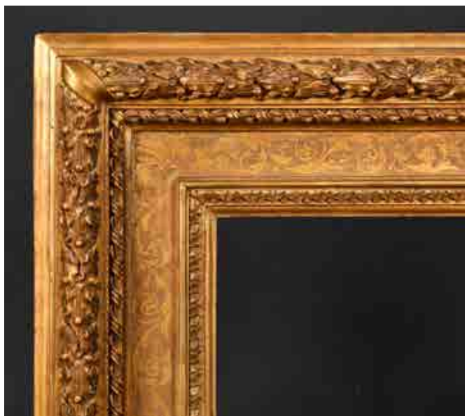
351. 19th Century Italian School A Fine Carved Giltwood Frame, rebate 28.25" x 16.5" (71.7 x 41.9cm) £150-£250