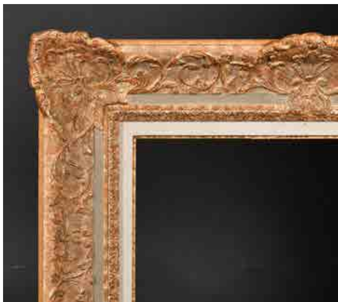
335. 20th Century French School A Gilt and Painted Composition Frame with swept centres and corner and a fabric slip, rebate 30" x 19.75" (76.2 x 50.1cm) without slip 32" x 21.5" (81.3 x 54.6cm) £60-£80