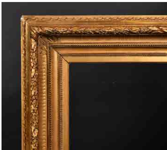
362. 19th Century European School A Gilt Composition Frame, rebate 26.25" x 21.5" (66.7 x 54.6cm) £100-£150