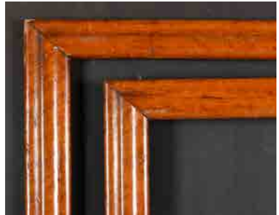
398. 19th Century English School A Pair of Maple Frames, rebate 21.5" x 17.5" (54.6 x 44.4cm), and another, with a gilt slip, rebate 22.25" x 16.25" (56.5 x 41.3cm) (3) £60-£80