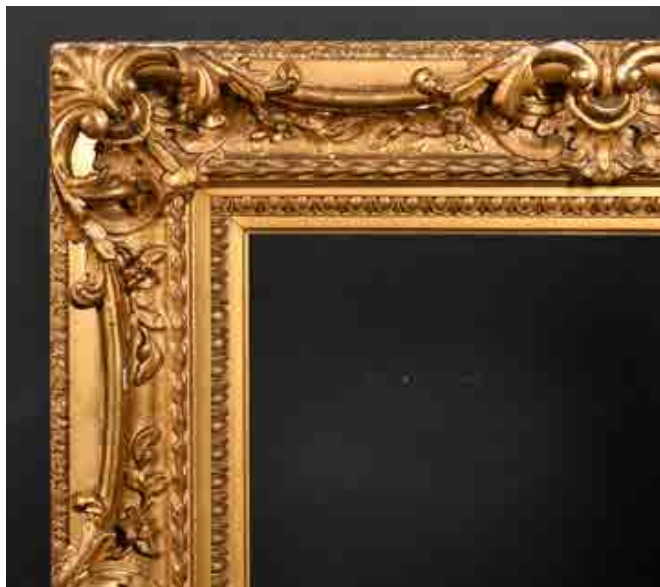
360. Early 19th Century English School A Carved Giltwood Frame, with swept and pierced centres and corners, and a composition outer edge, rebate 27" x 22" (68.6 x 55.8cm), without slip, rebate 30" x 25.5" (76.2 x 64.8cm) £200-£300