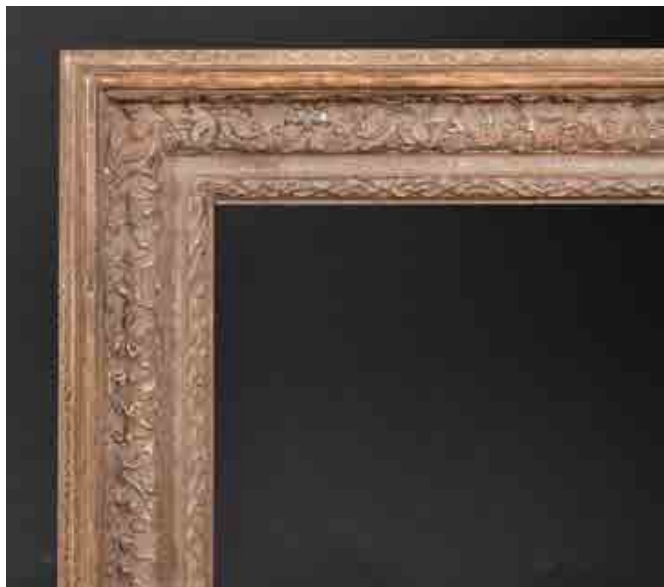
313. 20th Century English School A Painted Composition Frame, rebate 34" x 25" (86.3 x 63.5cm) £100-£150