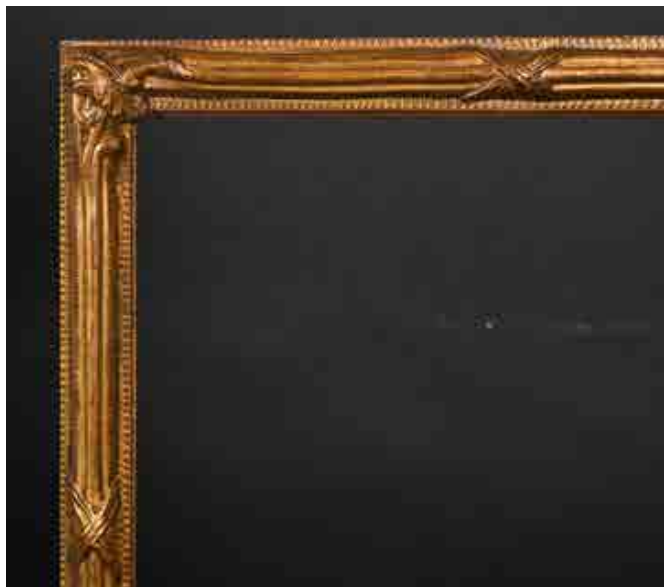
319. 19th Century French School A Gilt Composition Frame, rebate 31.5" x 29.25" (80 x 74.3cm) £50-£80