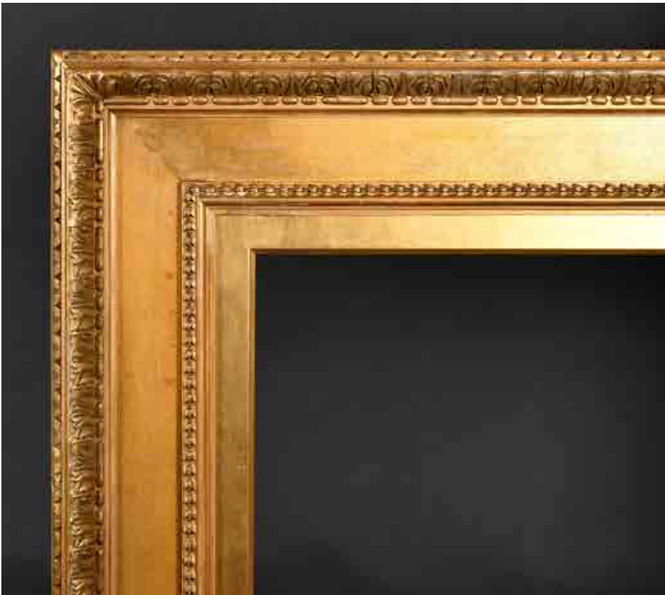
306. 19th Century English School A Watts Gilt Composition Frame, rebate 36" x 28" (91.5 x 71.1cm) £300-£400