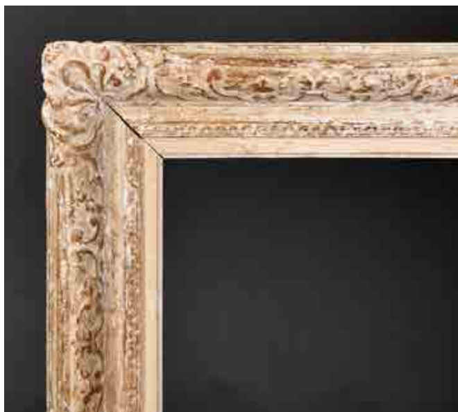
300. 20th Century French School A Louis Style Painted Carved Wood Frame, rebate 36.5" x 31" (92.7 x 78.7cm) £50-£80