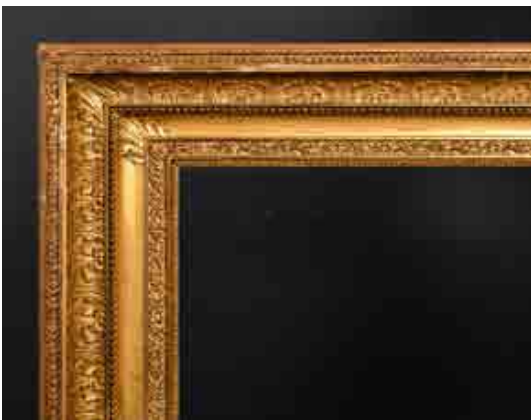
367. 19th Century English School A Gilt Composition Frame, rebate 25.5" x 19" (64.7 x 48.2cm) £60-£80