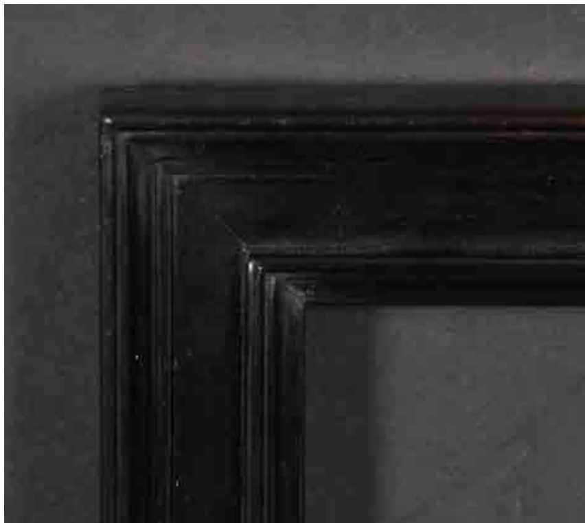
460. 20th Century European School A Black Composition Frame, rebate 3.4" x 2.65" (8.7 x 6.7cm) £50-£80