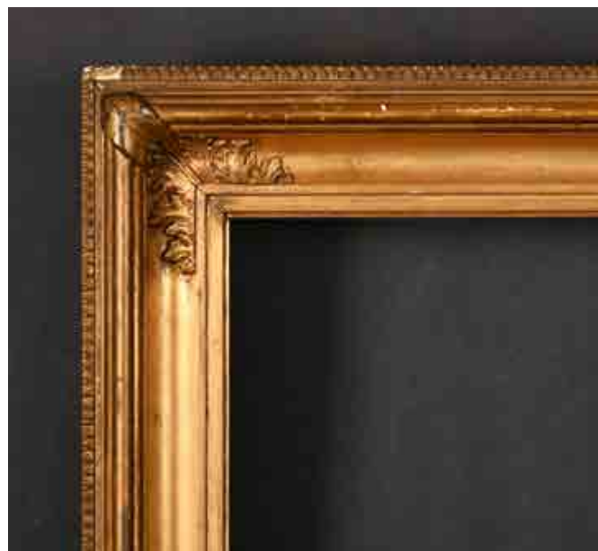
391. 19th Century English School A Gilt Composition Hollow Frame, rebate 22.25" x 17.5" (56.6 x 44.4cm) £80-£120