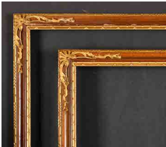
375. 20th Century English School A Pair of Ornate Wooden Frames, with gilt inner and outer edges, rebate 24.25" x 21.5" (61.6 x 54.6cm) (2) £80-£120