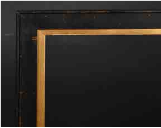
363. 20th Century English School A Black Painted Frame, with gilt slip, rebate 26" x 22.5" (66 x 57.2cm) £50-£80