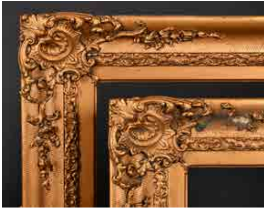
326. 19th Century English School A Pair of Painted Composition Frames with swept corners, rebate 30" x 25" (76.2 x 63.5cm) £50-£80