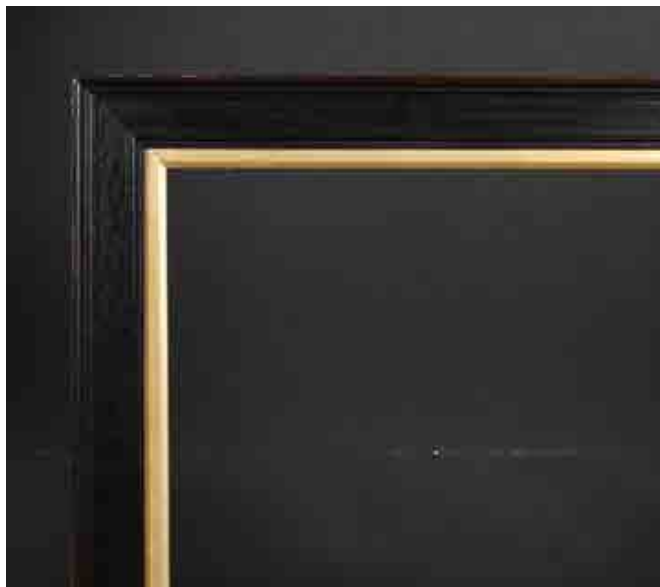
314. 20th Century English School A Painted Wooden Frame, with a gilt slip, rebate 33.75" x 28" (85.7 x 71.1cm) £50-£80