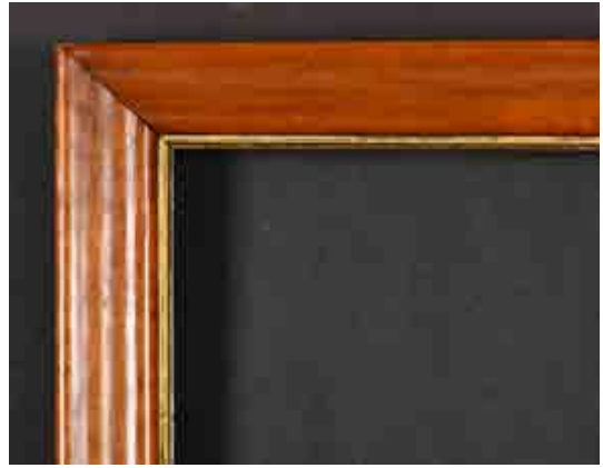
370. 19th Century English School A Maple Frame with a gilt slip, rebate 25" x 18.5" (63.5 x 47cm), and another similar, rebate 24.5" x 19" (62.2 x 48.2cm) (2) £50-£80