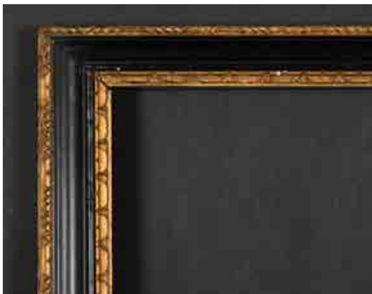
387. 19th Century English School A Hogarth Style Frame, rebate 23.25" x 18" (59.1 x 45.7cm), and two others similar, rebate 19.25" x 17.25" (48.9 x 43.8cm), and 17.25" x 15.75" (43.8 x 40cm) (3) £60-£80