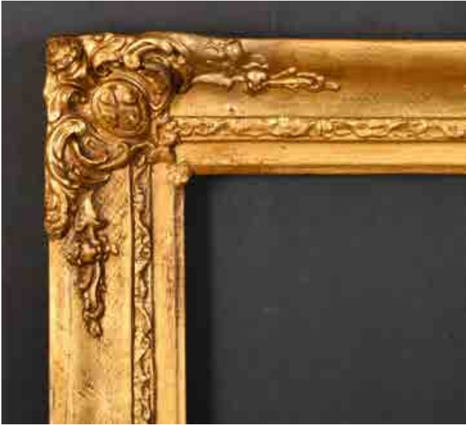
450. 19th Century English School A Gilt Composition Frame, with swept corners, rebate 12" x 10" (30.5 x 25.4cm), and another frame 19th Century French School and Empire Composition Frame, rebate 10.5" x 7" (26.7 x 17.8cm) (2) £50-£80