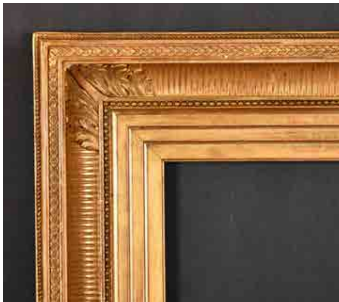
447. 19th Century English School A Gilt Composition Frame, rebate 13.25" x 9" (33.7 x 22.8cm) £80-£120