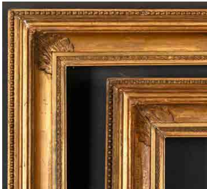
389. 19th Century English School A Pair of Gilt Composition Frames, rebate 22.5" x 18.5" (57.2 x 47cm) (2) £80-£120