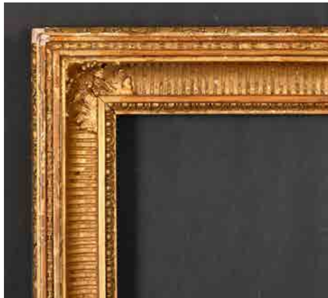
412. 19th Century English School A Gilt Composition Frame, rebate 19" x 13" (48.2 x 33cm) £50-£80