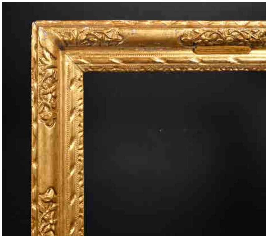
338. Late 18th Century English School A Gilt and Painted Carved Wood Frame with Lely panels, rebate 29.5" x 24.5" (74.9 x 62.2cm) £300-£500