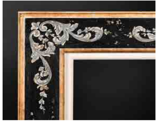
384. 20th Century Italian School An Ornately Painted Composition Frame with a white slip, rebate 23.75" x 7.75" (60.3 x 19.7cm) £50-£80