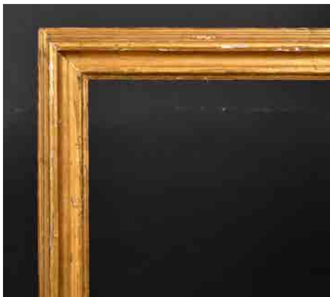
352. 19th Century English School A Gilt Composition Frame, rebate 28" x 23.25" (71.2 x 59.1cm) £150-£250