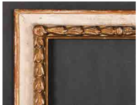
400. 20th Century English School A Carved Giltwood and Painted Frame, rebate 21.5" x 12" (54.6 x 30.5cm) £50-£80