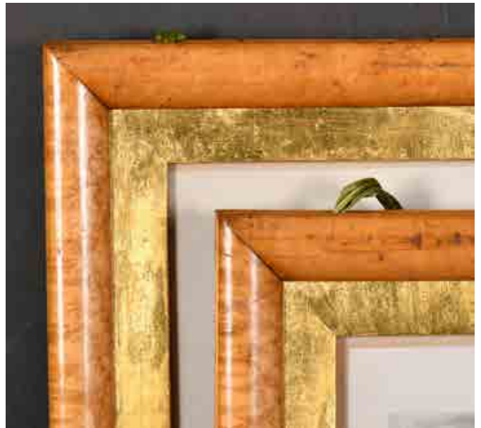
451. 19th Century English School A Fine Pair of Maple Frames, with gilt slips and inset print and glass, rebate 10.5" x 7" (26.7 x 17.7cm), together with another similar frame, rebate 6.75" x 5.75" (17.2 x 14.4cm) (3) £150-£200