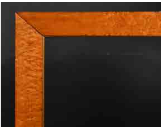
357. 19th Century English School A Maple Frame, with a gilt slip, rebate 27.5" x 18" (69.8 x 45.7cm) £50-£80