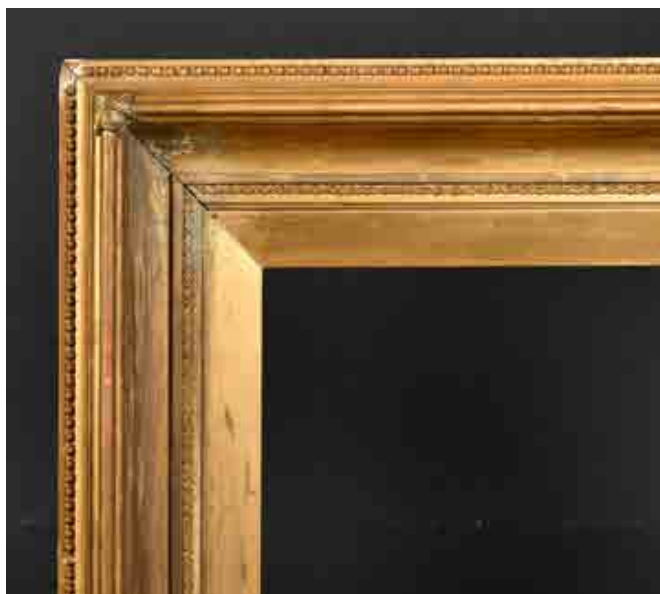
336. 19th Century English School A Gilt Composition Frame, rebate 30" x 16" (76.2 x 40.6cm) £50-£80