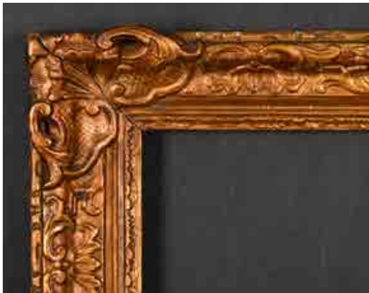
425. 19th Century English School A Gilt Composition Frame with swept corners, rebate 16.5" x 14.25" (41.9 x 36.2cm) £50-£80