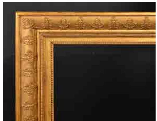
368. 19th Century French School An Empire Composition Frame, rebate 25.5" x 18.75" (64.7 x 47.6cm) £100-£150