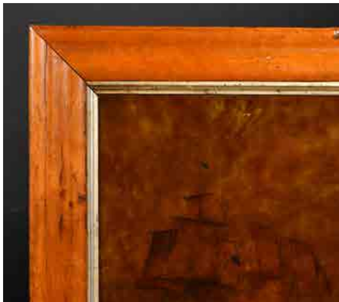
320. 19th Century English School A Maple Frame with a gilt slip with two openings and inset glass, 31.5" x 19" (80 x 48.2cm) each rebate of openings 18" x 14.25" (45.7 x 36.2cm) £60-£80