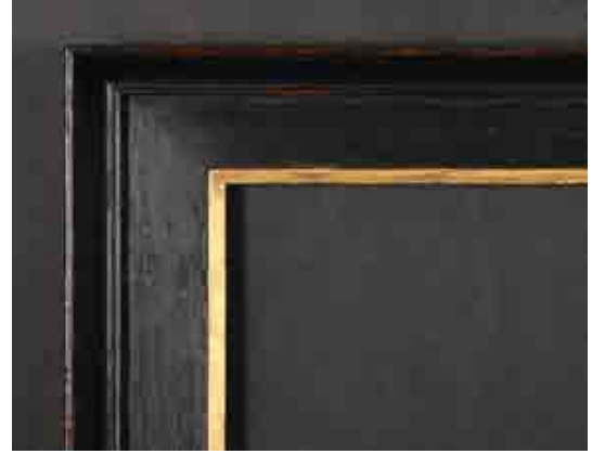
442. 20th Century English School A Black Painted Frame, with gilt inner edge, rebate 14.75" x 10.5" (37.4 x 26.7cm), and two other frames of different sizes (3) £40-£60