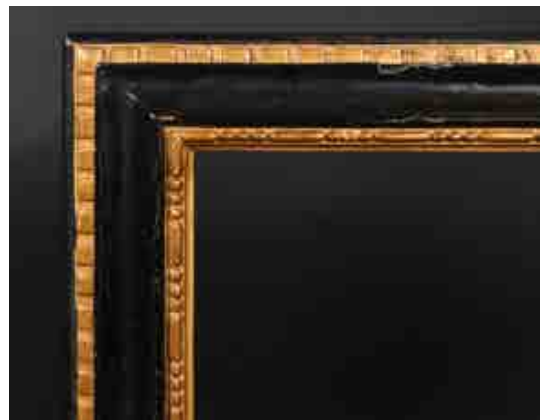
388. Late 18th Century Spanish School A Black Painted Frame, with gilt inner and outer edges, rebate 23" x 17.5" (58.4 x 44.4cm) £100-£200