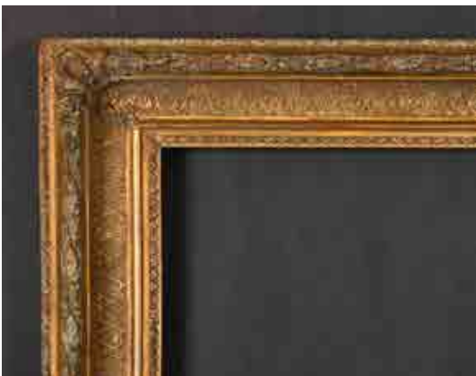
399. 19th Century English School A Gilt Composition Frame, rebate 21.5" x 13.5" (54.6 x 34.3cm) £50-£80