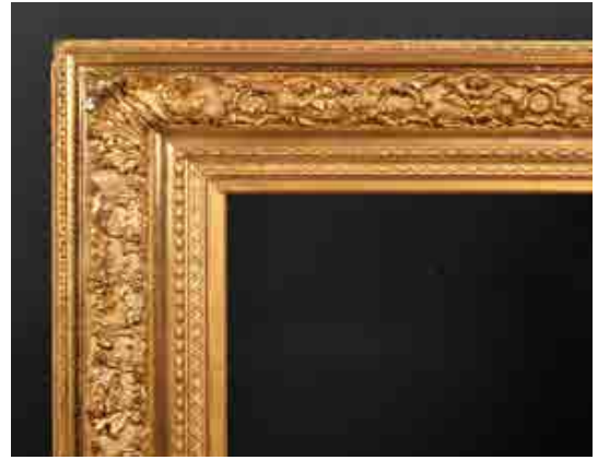
364. 19th Century English School A Gilt Composition Frame, rebate 26" x 21.5" (66.1 x 54.6cm) £80-£120