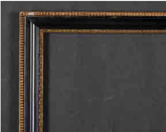
397. 19th Century English School A Hogarth Style Frame, rebate 21.5" x 18" (54.6 x 45.7cm), and four others similar (5) £50-£80