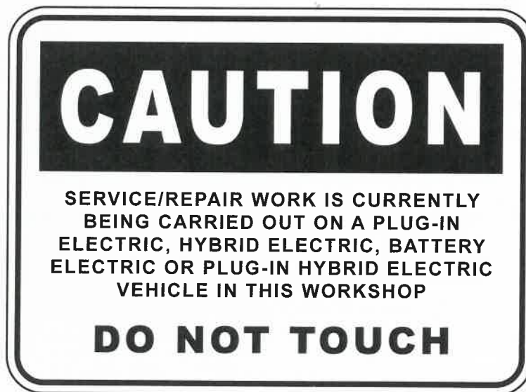
Figure 2 — Example caution sign