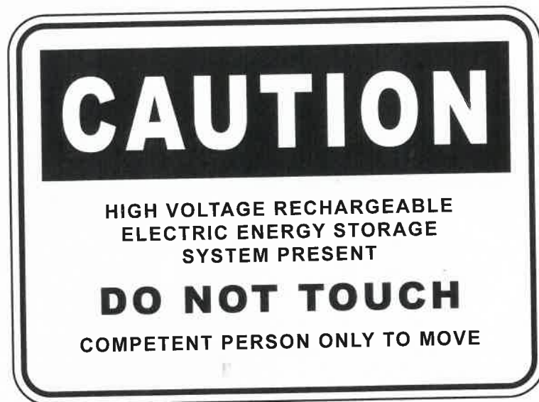
Figure 3 — Example caution sign

CAUTION — HIGH VOLTAGE RECHARGEABLE ELECTRIC ENERGY STORAGE SYSTEM PRESENT. DO NOT TOUCH. COMPETENT PERSON ONLY TO MOVE.