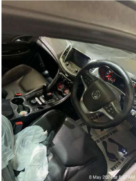
Added by: Spiros Nitsos Date: 14/05/2024 11:45 AM