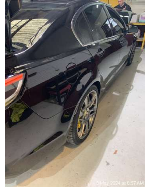
Added by: Spiros Nitsos Date: 14/05/2024 11:45 AM