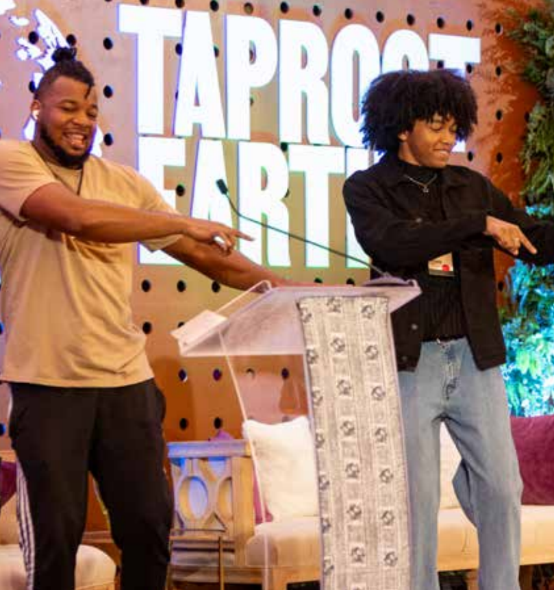
Image (left): Movement Makers leads the Global Climate Reparations Governance Assembly in an energizer for the body