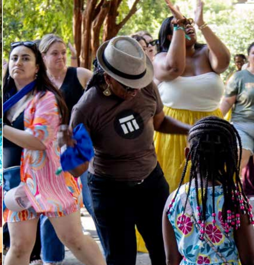
Image (right): A line dance at the #WeChooseNow Community Assembly in Birmingham, Alabama