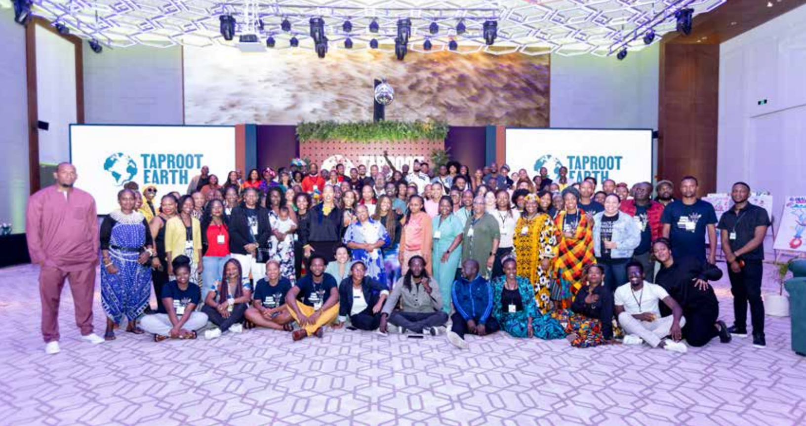
Image: The 200 participants at the Global Climate Reparations Governance Assembly 2024 in Nairobi, Kenya