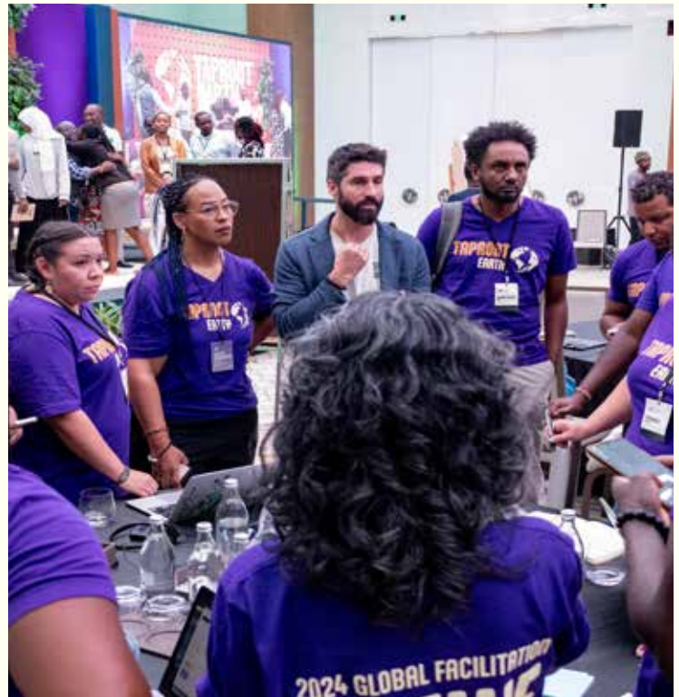
Image: The Global Climate Reparations facilitation team discusses strategy

investments and called for community-generated solutions, such as the Community Controlled Fund model .