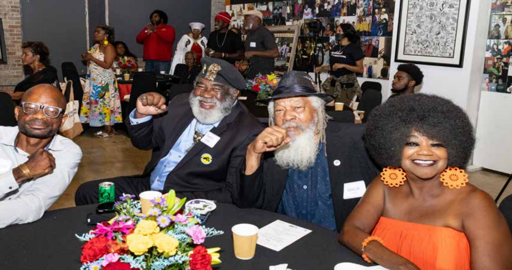
Image: Frontline, community leaders enjoy the celebration at the Katrina 19 Rooted in Resistance Dinner in August 2024

vision among movement leaders and built power by strengthening inter-organizational relationships. Overall, participants from 29 countries and 125 organizations rooted in Black liberation came together to create a Global Climate Reparations working statement to guide frontline work for years to come.