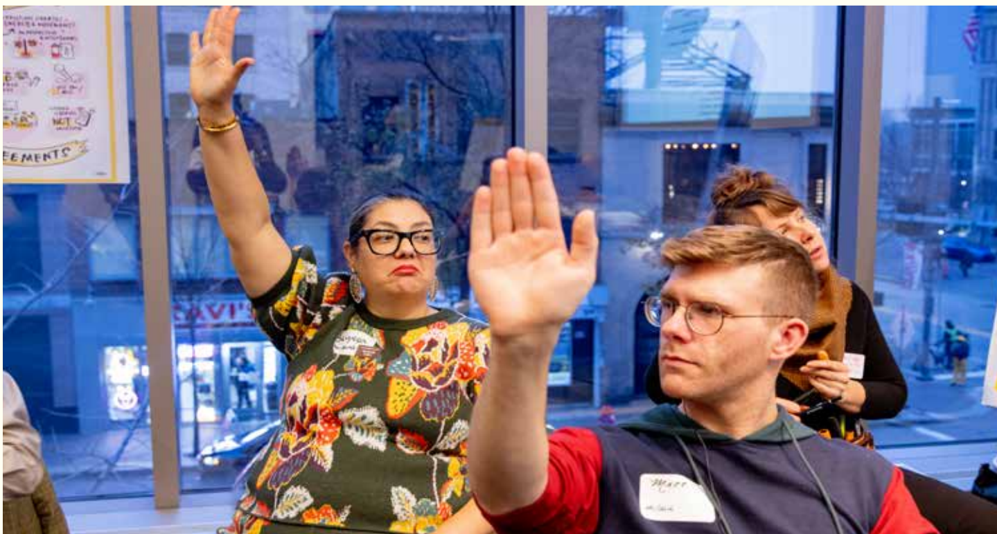
Image: Participants raise their hands at the GS2A Governance Assembly in Pittsburgh, PA in December 2024