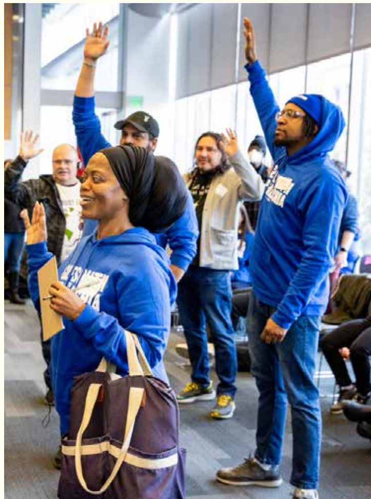
Image: The GS2A Governance Assembly participants raise their hands

By leveraging our access and philanthropic partners, Taproot Earth mobilized hundreds of thousands of dollars to support frontline-led projects and organizations. As part of our commitment to frontline accountability, we ensure that our investments in local partner organizations reflect our values of Black Liberation and Indigenous Sovereignty.