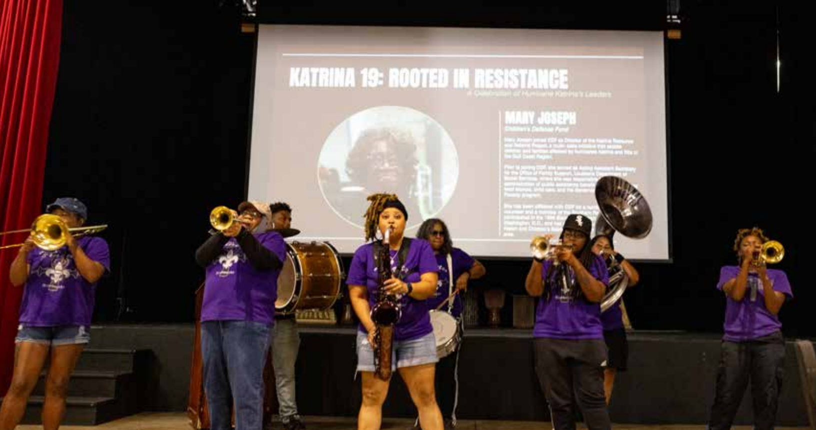
Image: The Original Pinettes Brass Band plays at the Katrina 19: Rooted in Resistance Dinner in August of 2024