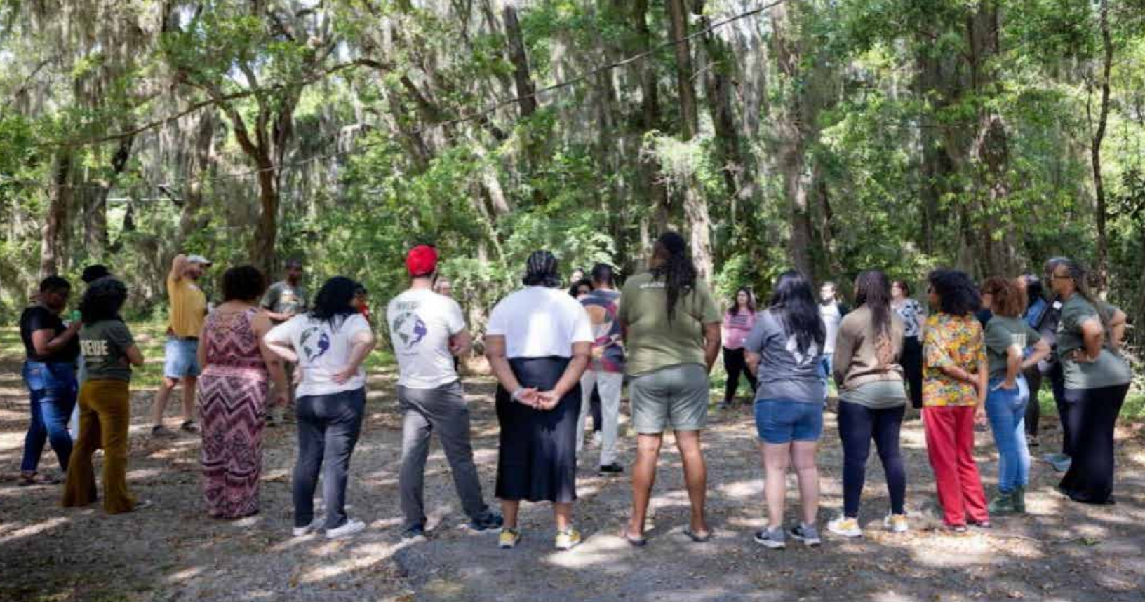
Image (above): At Taproot Earth's All Krewe Retreat in April 2024, we spent time in reflecting, planning, and relationship building at the sacred site of the Penn Center , a long-time movement training grounds, on St. Helena Island, South Carolina.