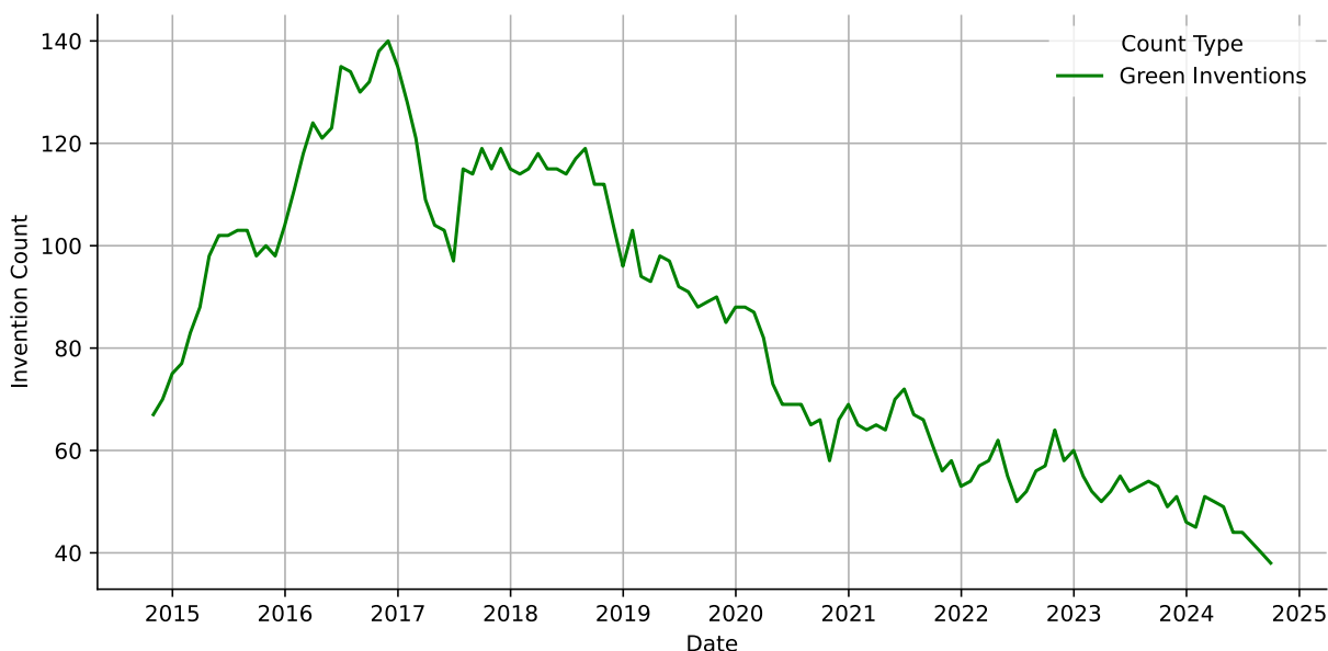
Rolling 1-Year Invention Count

The graph above illustrates the number of green inventions published by the company over the past decade. Data is presented monthly, with each point representing the total green invention count for the preceding 12 months.