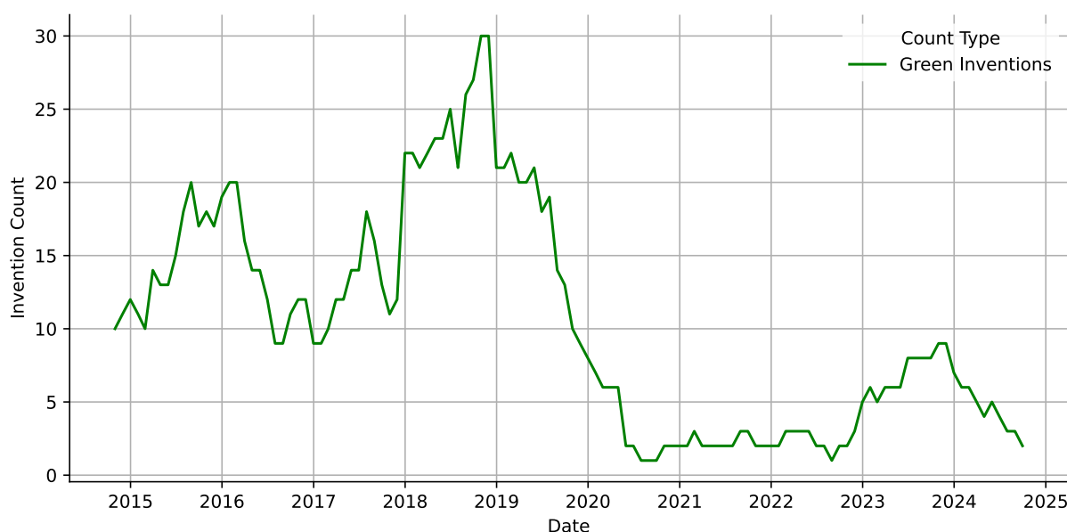
Rolling 1-Year Invention Count

The graph above illustrates the number of green inventions published by the company over the past decade. Data is presented monthly, with each point representing the total green invention count for the preceding 12 months.