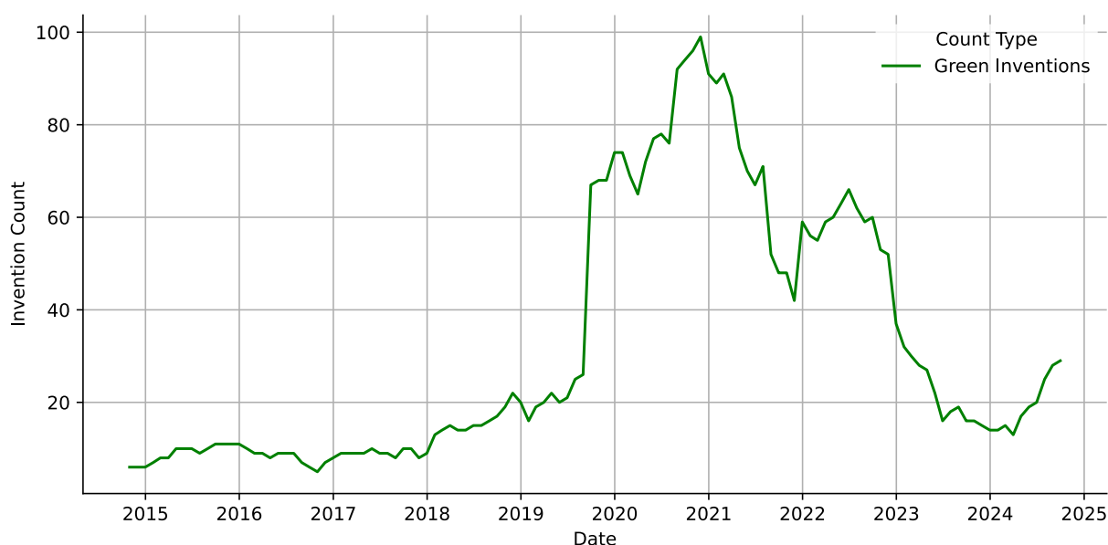
Rolling 1-Year Invention Count

The graph above illustrates the number of green inventions published by the company over the past decade. Data is presented monthly, with each point representing the total green invention count for the preceding 12 months.