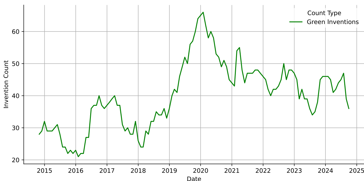
Rolling 1-Year Invention Count

The graph above illustrates the number of green inventions published by the company over the past decade. Data is presented monthly, with each point representing the total green invention count for the preceding 12 months.