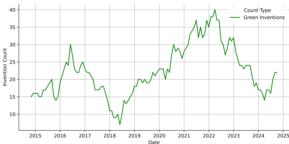
Rolling 1-Year Invention Count

The graph above illustrates the number of green inventions published by the company over the past decade. Data is presented monthly, with each point representing the total green invention count for the preceding 12 months.