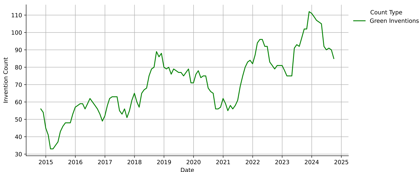
Rolling 1-Year Invention Count

The graph above illustrates the number of green inventions published by the company over the past decade. Data is presented monthly, with each point representing the total green invention count for the preceding 12 months.