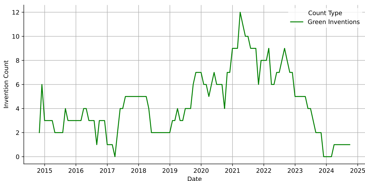
Rolling 1-Year Invention Count

The graph above illustrates the number of green inventions published by the company over the past decade. Data is presented monthly, with each point representing the total green invention count for the preceding 12 months.