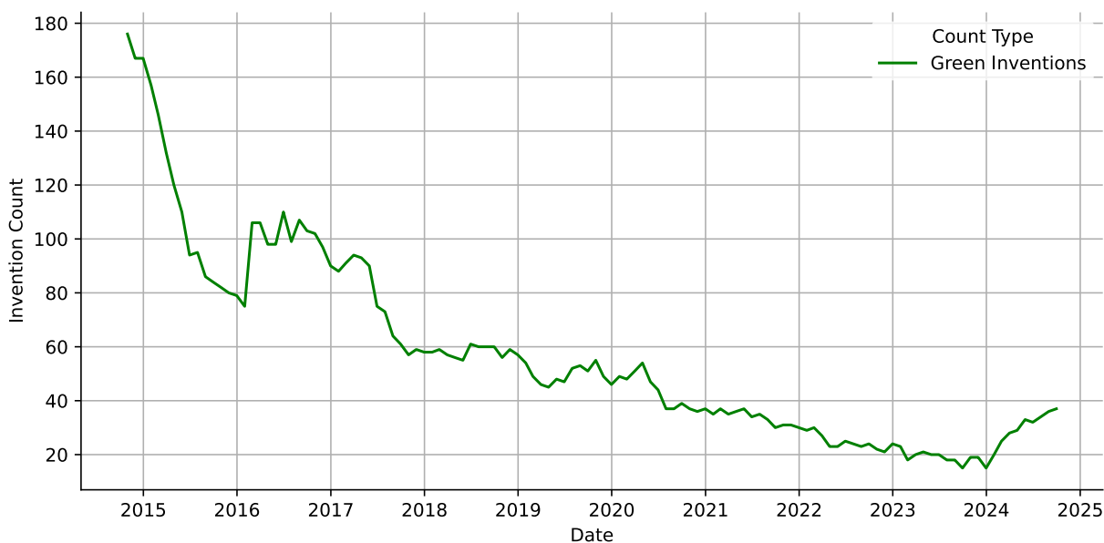
Rolling 1-Year Invention Count

The graph above illustrates the number of green inventions published by the company over the past decade. Data is presented monthly, with each point representing the total green invention count for the preceding 12 months.