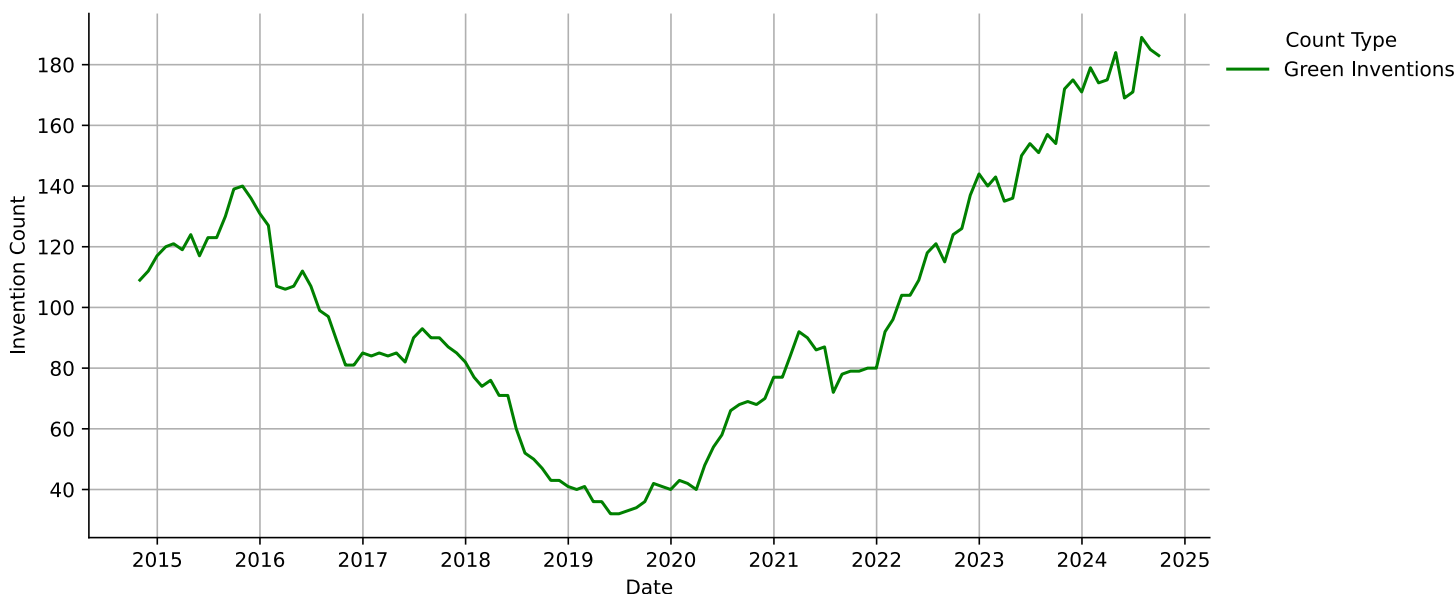
Rolling 1-Year Invention Count

The graph above illustrates the number of green inventions published by the company over the past decade. Data is presented monthly, with each point representing the total green invention count for the preceding 12 months.