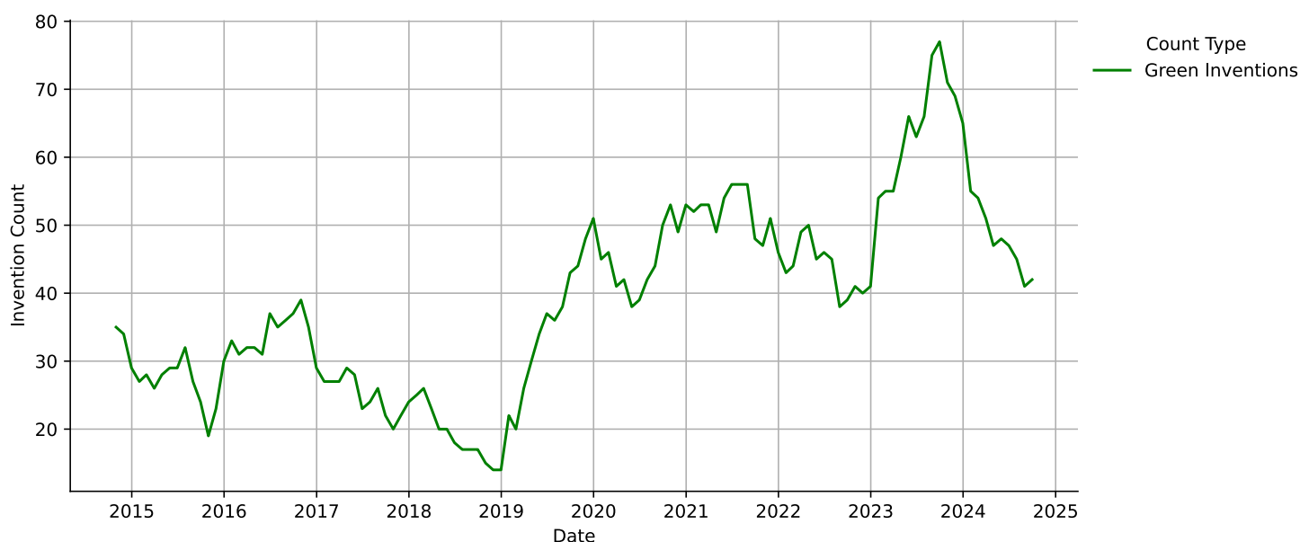
Rolling 1-Year Invention Count

The graph above illustrates the number of green inventions published by the company over the past decade. Data is presented monthly, with each point representing the total green invention count for the preceding 12 months.