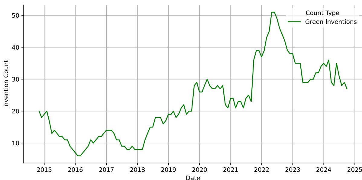
Rolling 1-Year Invention Count

The graph above illustrates the number of green inventions published by the company over the past decade. Data is presented monthly, with each point representing the total green invention count for the preceding 12 months.