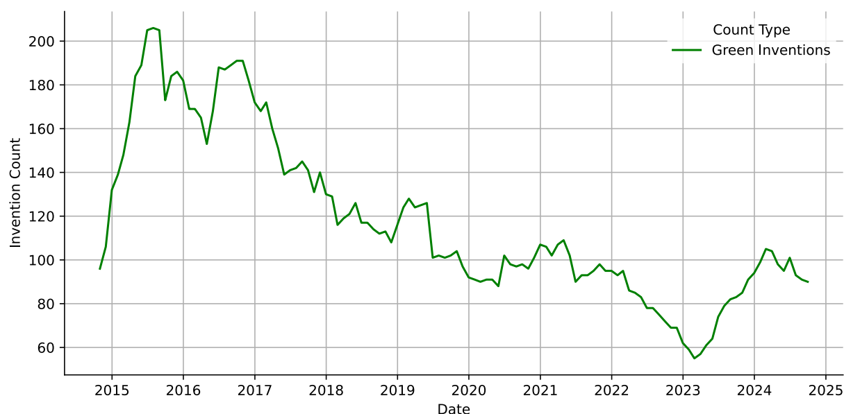
Rolling 1-Year Invention Count

The graph above illustrates the number of green inventions published by the company over the past decade. Data is presented monthly, with each point representing the total green invention count for the preceding 12 months.