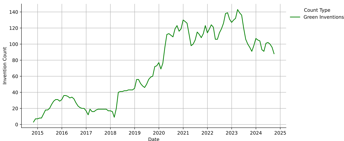
Rolling 1-Year Invention Count

The graph above illustrates the number of green inventions published by the company over the past decade. Data is presented monthly, with each point representing the total green invention count for the preceding 12 months.