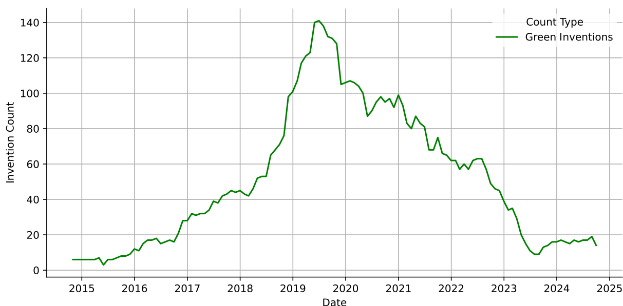
Rolling 1-Year Invention Count

The graph above illustrates the number of green inventions published by the company over the past decade. Data is presented monthly, with each point representing the total green invention count for the preceding 12 months.