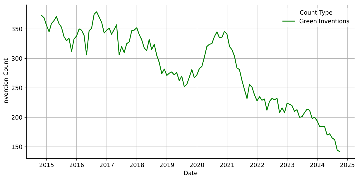
Rolling 1-Year Invention Count

The graph above illustrates the number of green inventions published by the company over the past decade. Data is presented monthly, with each point representing the total green invention count for the preceding 12 months.